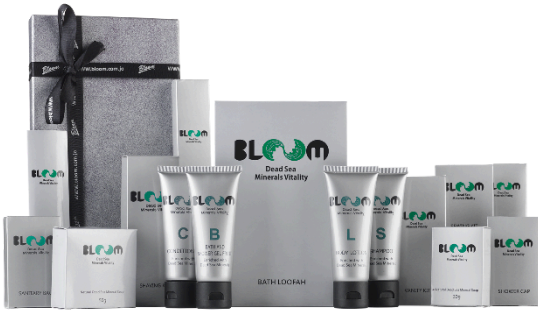
Before : 50 ml disposable plastic tubes

It's important to us that our clients (and partners) share our pillars and align with our values. This empowers us to keep innovating, just like our recent transformation of hotel soap and shampoo containers, which reduces waste, excess use, and promotes sustainability.