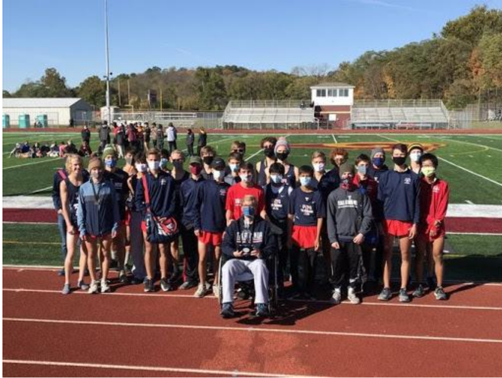
THS Cross Country @ SWOC.