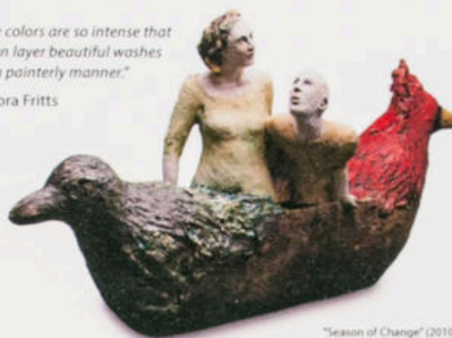
"Season of Change" (2010)