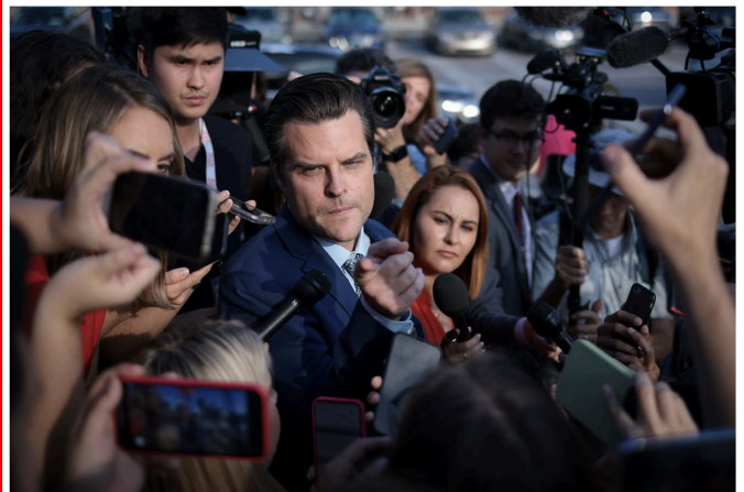
Rep. Matt Gaetz answers questions outside the US Capitol after successfully leading a vote to remove Rep. Kevin McCarthy from the office of Speaker of the House on Tuesday, October 3, 2023.

"You know it was personal," McCarthy says on Gaetz leading the charge on his removal as speaker