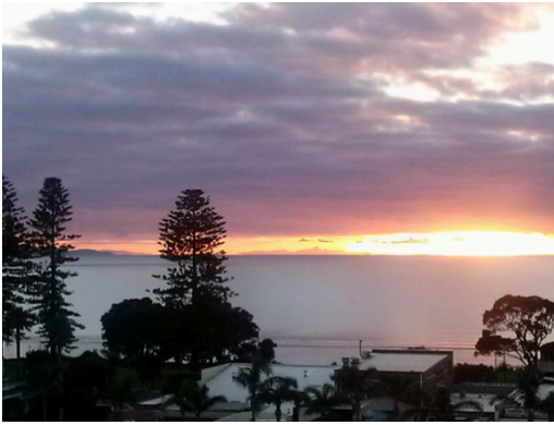
Figure 2 Great Barrier Island