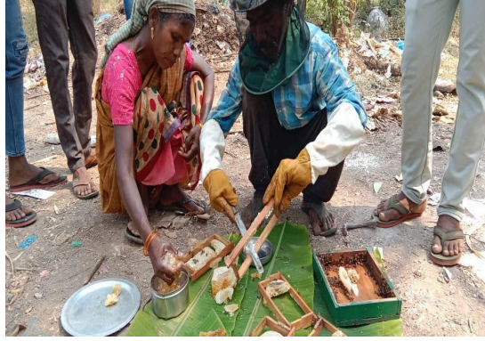
Harvesting of Honey