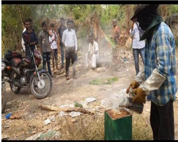
Smoking on bees