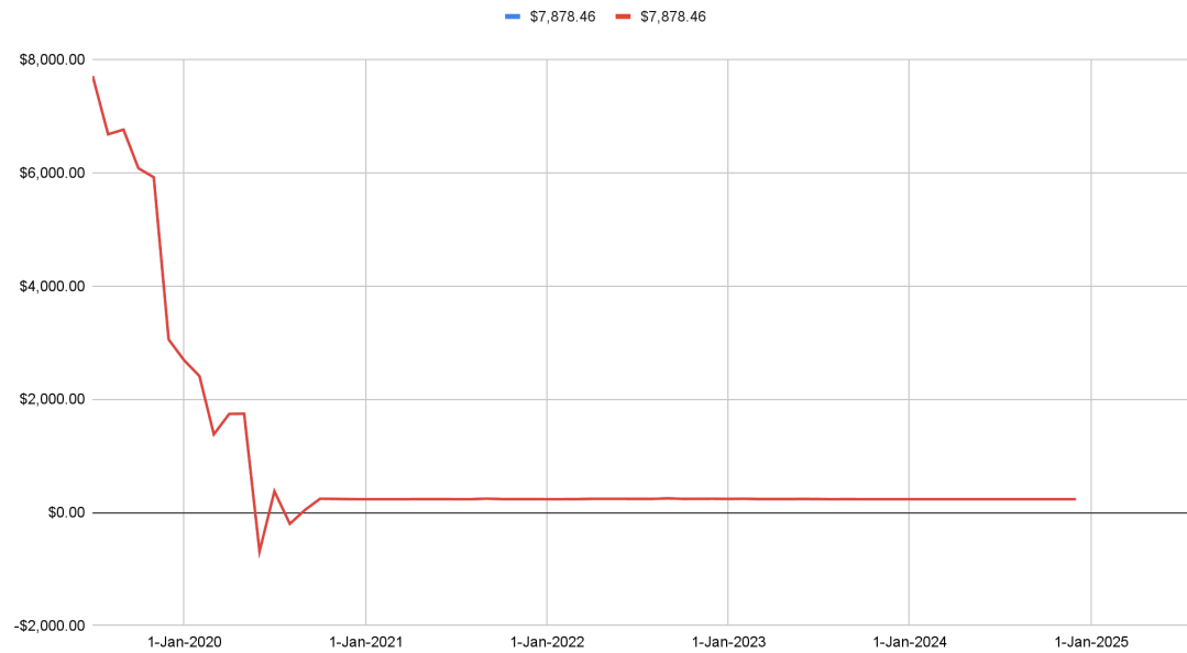
Telephone Costs by Month

~$415767.10. This excludes additional capital cost and contractor change order savings.