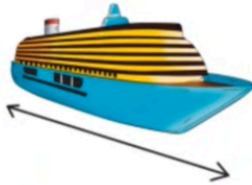
It's a _____ ship.