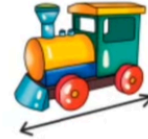
It's a _____ train.