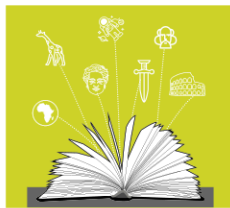
READ ACROSS THE CURRICULUM