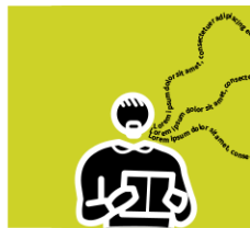
EMBRACE READING ALOUD