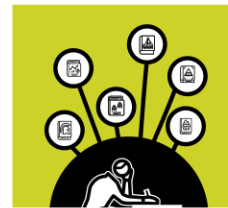
VALUE READING RECORDS AND DIARIES