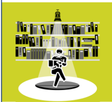
MODEL & CELEBRATE READING