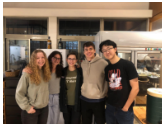
Fellow UMN students at banquet dinner