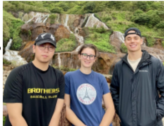
With my host brother and classmate