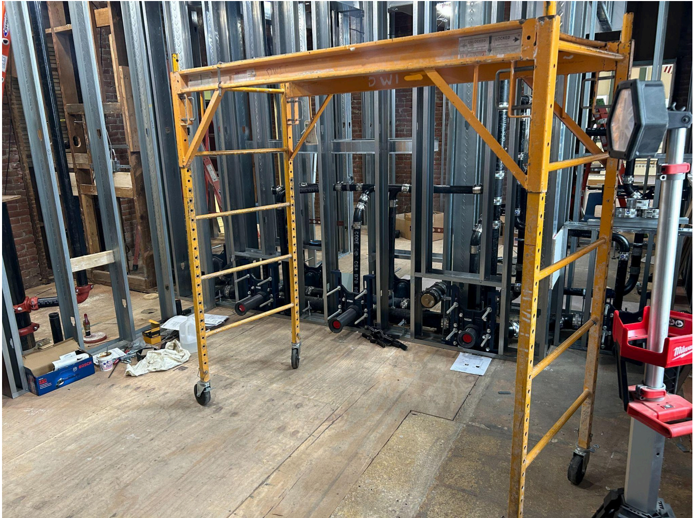
This picture is of the Girl's side of the gang bathroom in the 1904 wing of the building.