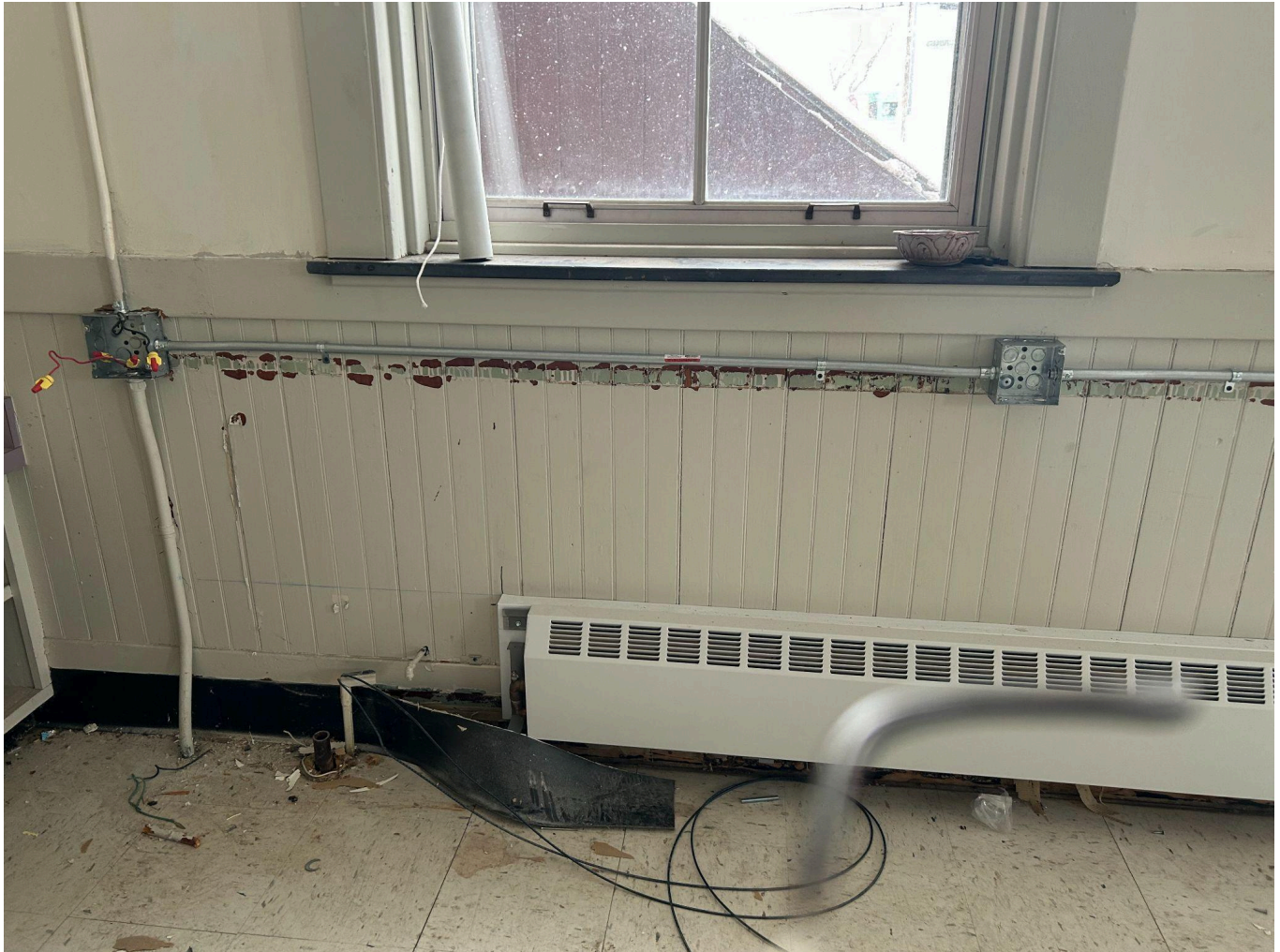
A picture showing the installation of JBoxes and conduit in the classrooms of the 1904 wing of the building. The BSD electrical team is doing this work, as a cost savings to the project. The old wire mold outlets were found by the Burlington Electrical Inspector to be non code compliant.