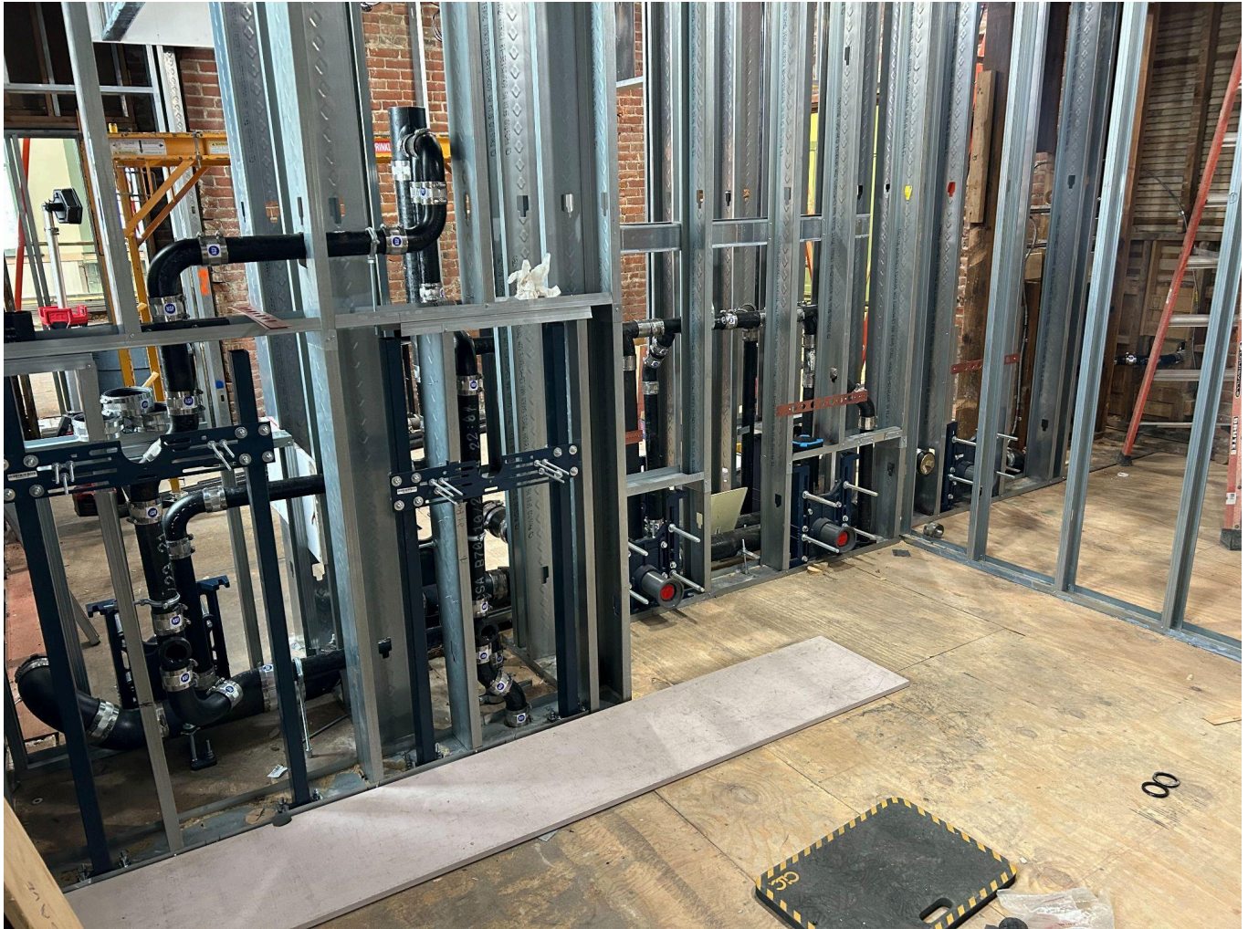
Framing is just about complete along with the plumbing rough-in for the gang bathroom renovation on the second floor of the 1904 wing of the building This picture is the Boy's side of the gang bathroom.