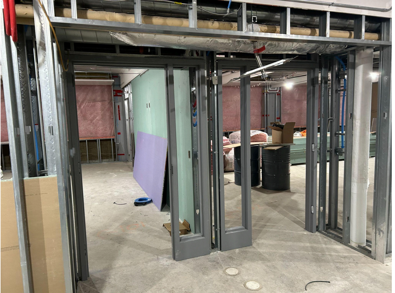
Door frames are being installed for the classrooms in the 1965 wing of the building. Another progression in completing the work needed for the renovation of the classrooms in the 19635 wing of the building.