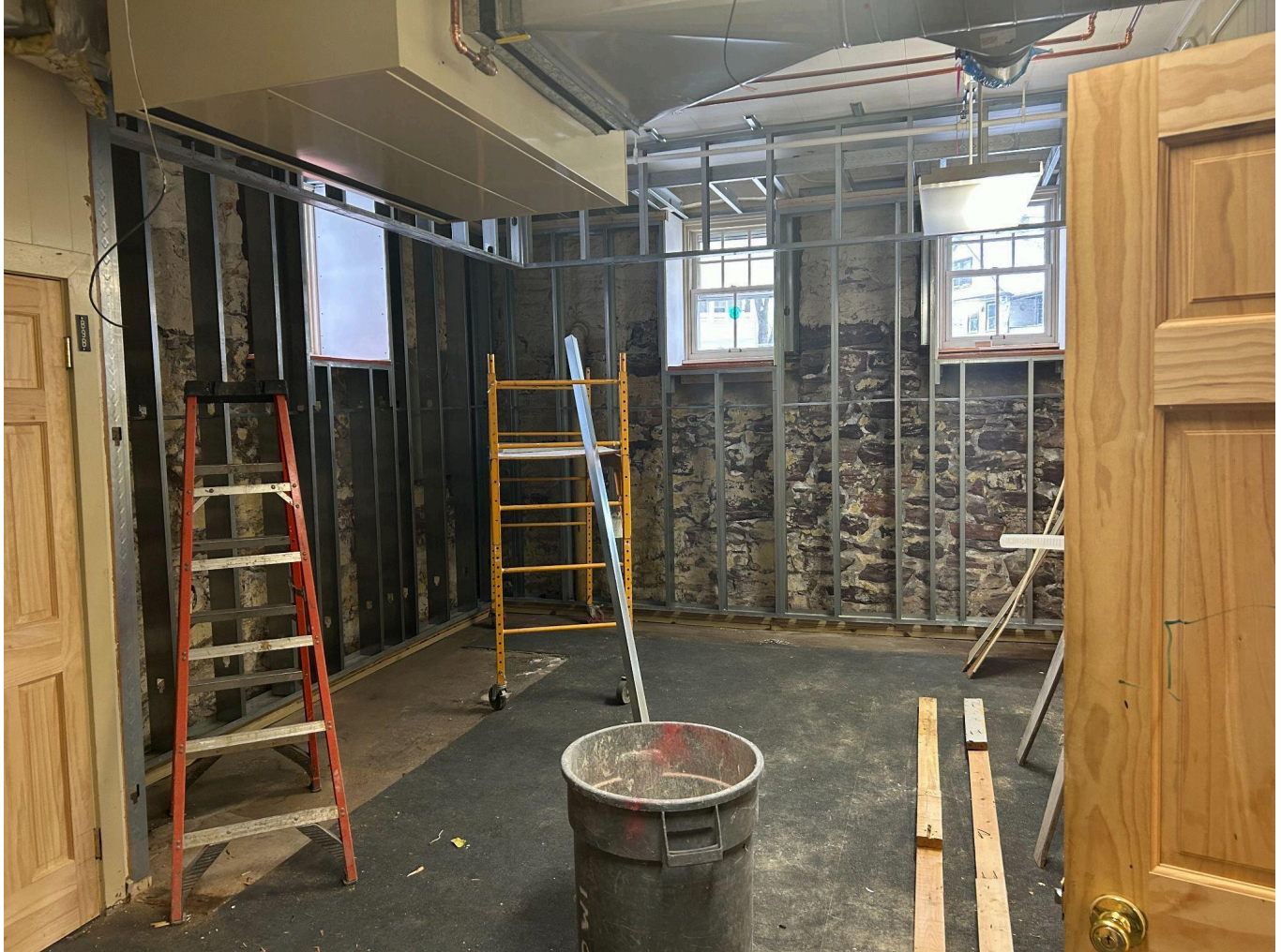
A picture showing the installation of the framing of the walls in the B09 classroom located in the Basement of the 1904 wing of the building.