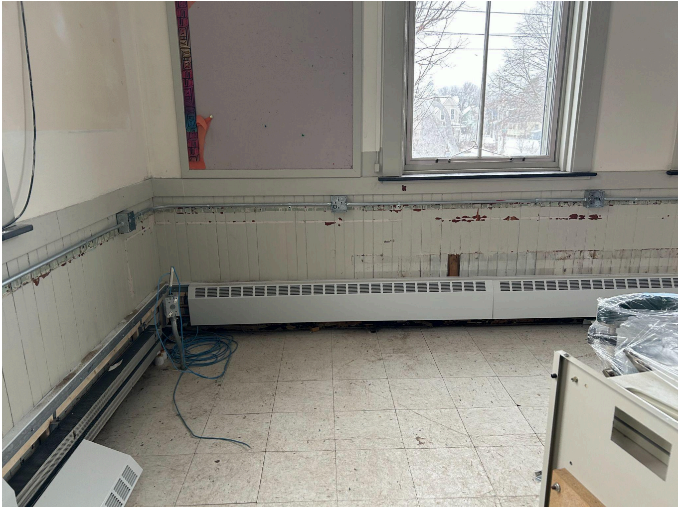
Another picture showing the installation of other JBoxes and conduit for electrical outlets in the classrooms of the 1904 wing of the building.