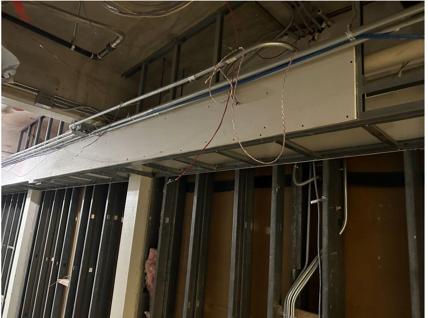
Sheetrock being installed on the new soffit in the 1965 wing of the building.