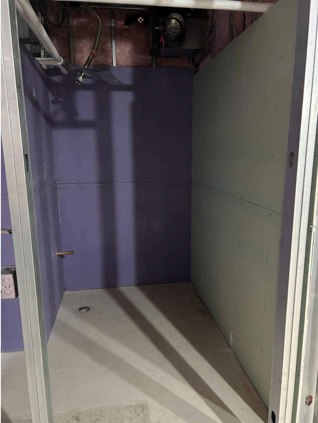
Sheetrock being installed on the bathroom walls that are located within the classrooms in the 1965 wing of the building.