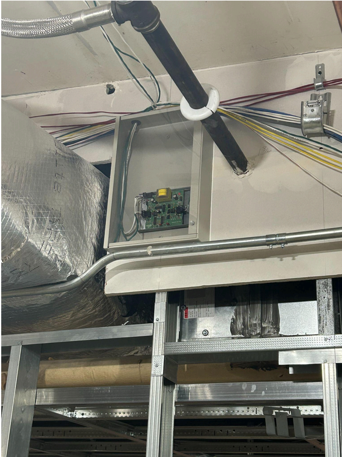
The installation of the temperature control wiring along with the control boards that will control the mechanical equipment. This is for the mechanical equipment in the 1965 wing of the building.