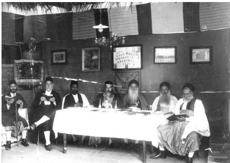
Jews from Libya Sitting in a Sukkah 1 , n.d.

What questions do these images raise about what Jewish worship looked like in pre-war North Africa?