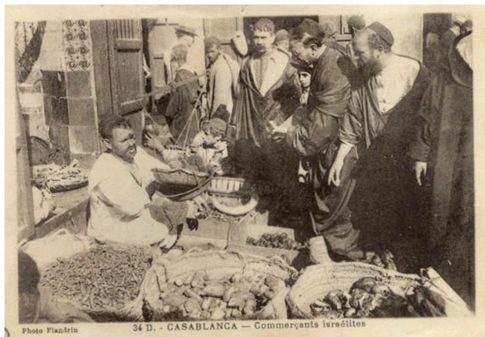
Israelite Traders, 1929.

What do you notice about some of the different roles Jews played in society?