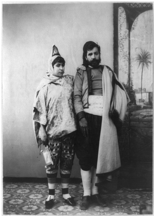
Jewish Couple in Tunisia, ca. 1890-1923.

What questions do these images raise about the types of clothes Jewish people chose to wear when posing for formal photographs?