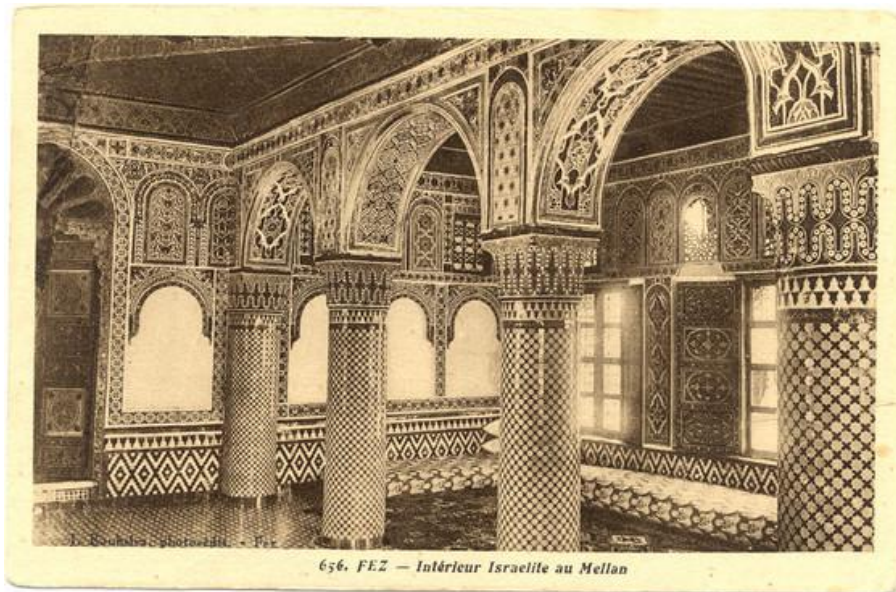
Interior of a Jewish home in the Mellah, 1915.

What might these images suggest about diversity in socio-economic status among the Jews of North Africa?