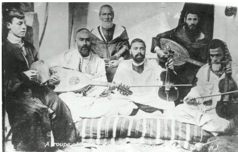
A troop of native minstrels, 1914.