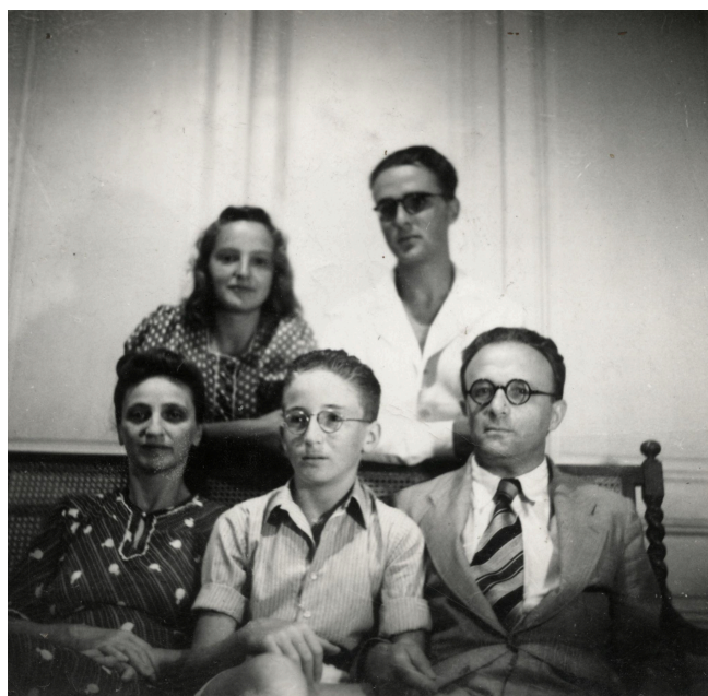
Portrait of the Beretvas Family in Their Home in Tunis, 1938.

What questions do these images raise about the types of clothes Jewish people chose to wear when posing for formal photographs?