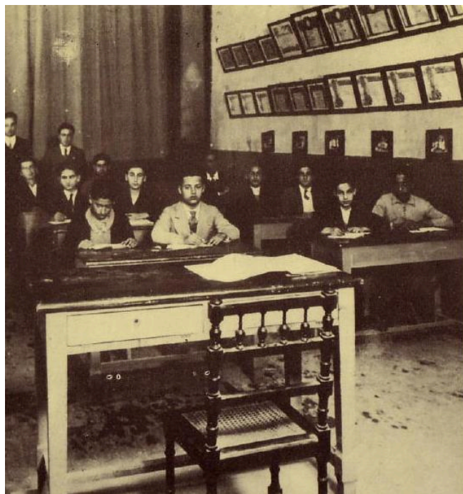
Libyan Jewish Classroom in Benghazi Synagogue, ca. 1930-1940.

What questions do these photos raise about Jewish education in pre-war North Africa?