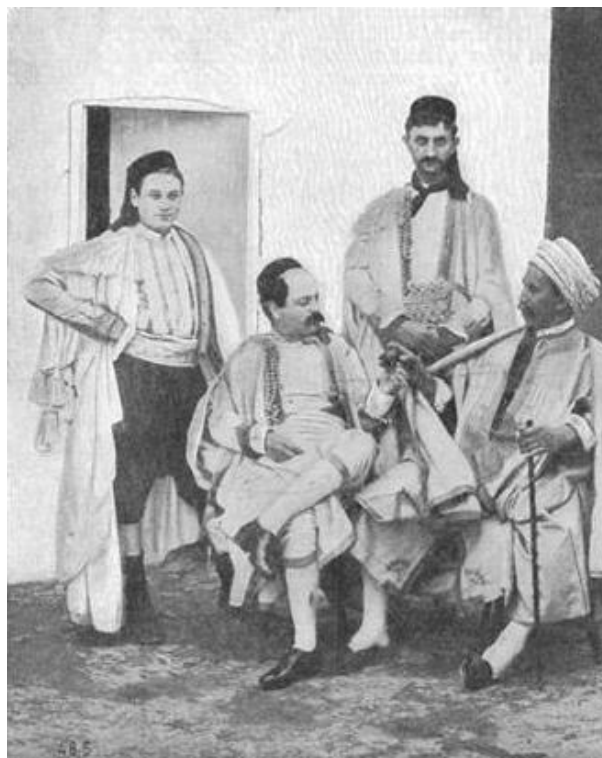
Jews of Tunis , ca. 1940.