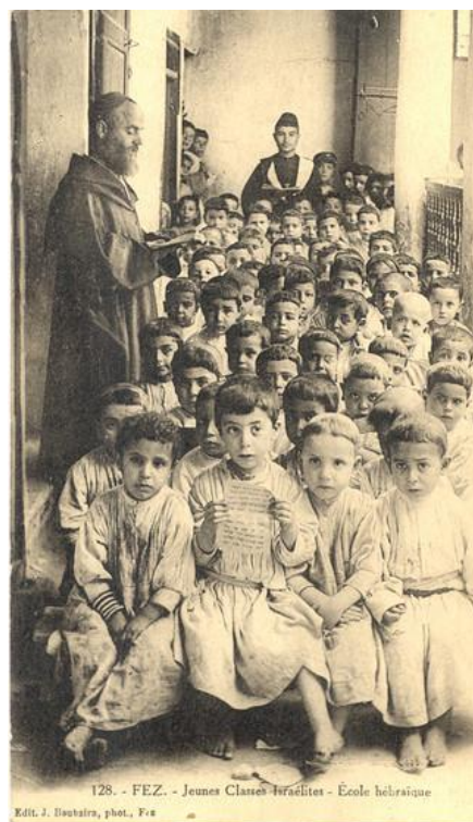
Young Jewish Classes, Fez, 1915.