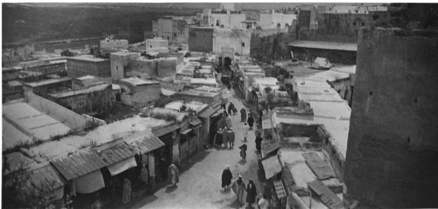
Paul Queste, Panoramic view of entrance to the Mellah, 1916.