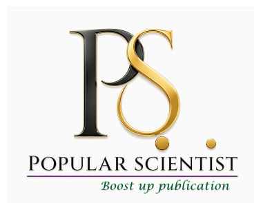
Figure 1. This is a figure.