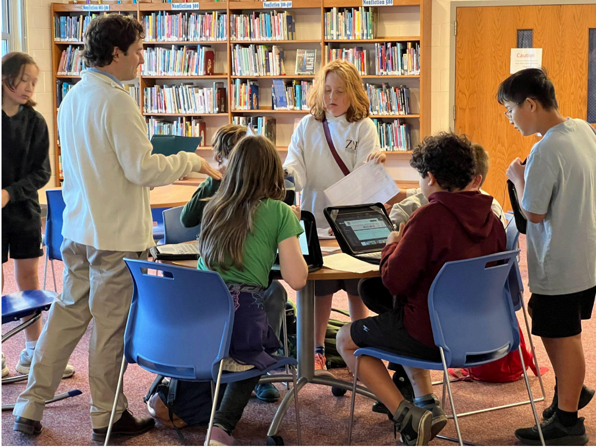
Two photos above: Dungeons and Dragons Club meeting in the Todd Library.