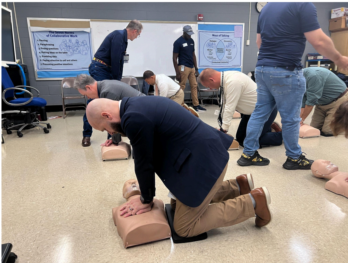
Above: Administrators were re-certified in CPR/AED this week.