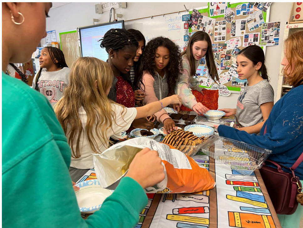
Three photos above: Todd Book Club is off to a lively start.