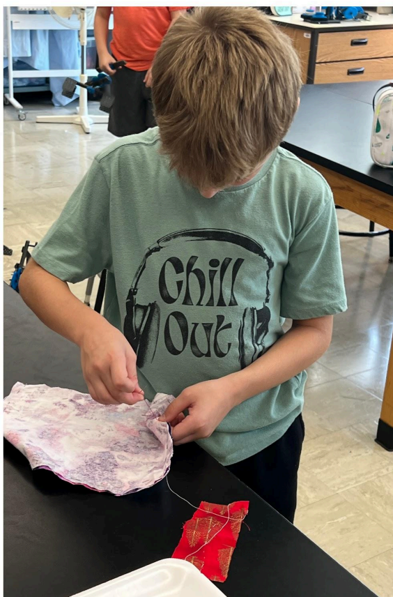
Photos above: Fourth grade students working on VEX Robotics projects and making pillows.