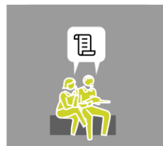
SCRIPT ROUTINES & KNOWN SCENARIOS