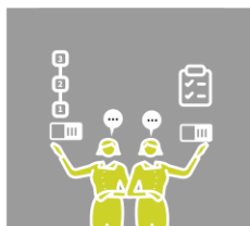
ESTABLISH KNOWN COMMANDS & CUES