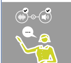
FIND A NATURALLY ASSERTIVE REGISTER