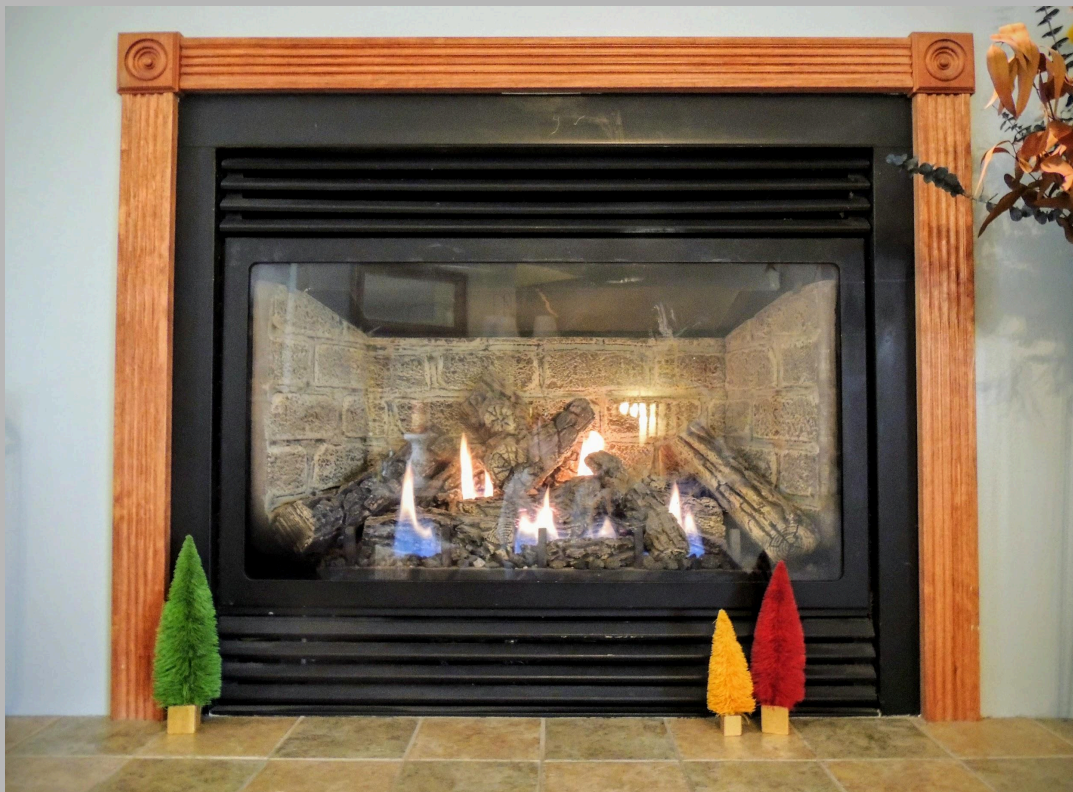
Paige Twidell Photo 2.mp3