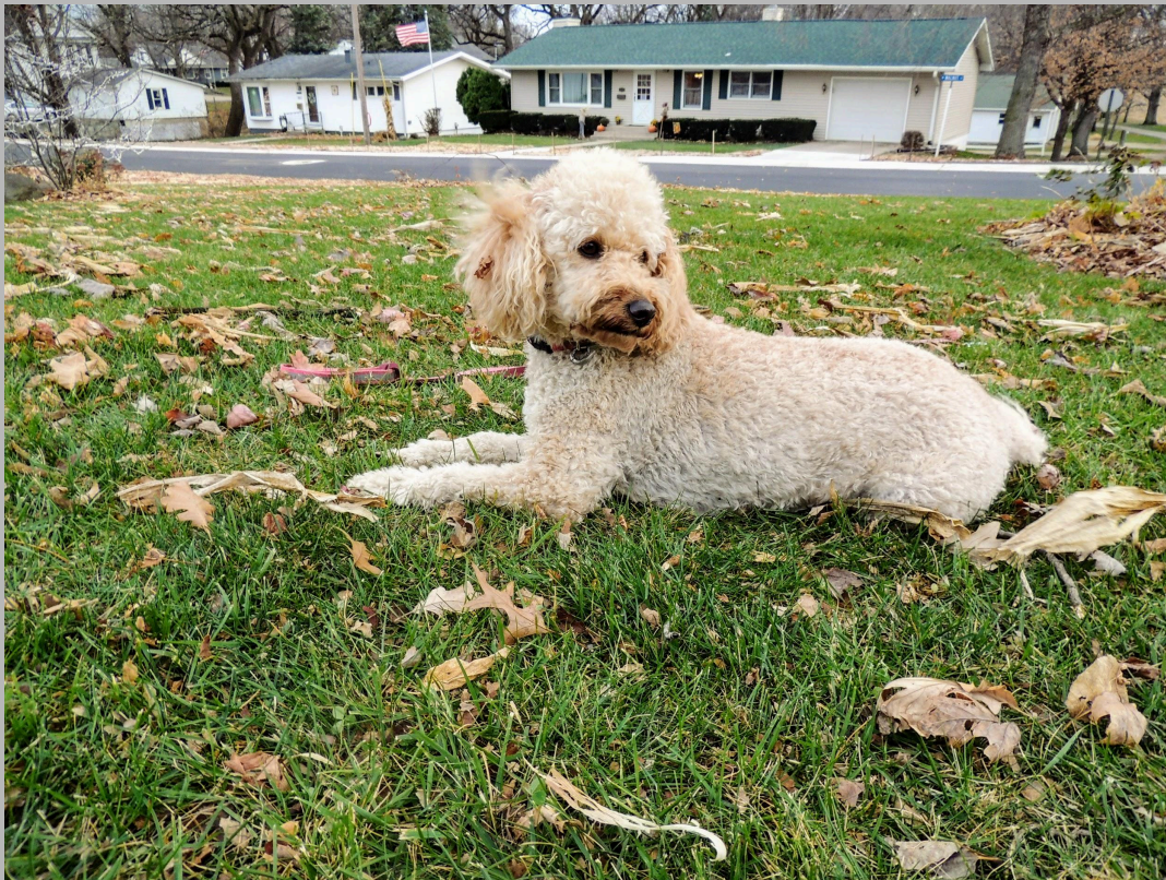
Paige Twidell Photo 1.mp3