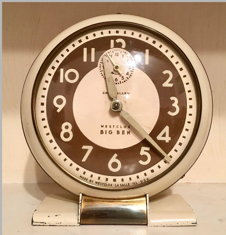
Grace Zeman Photo 2.mp3