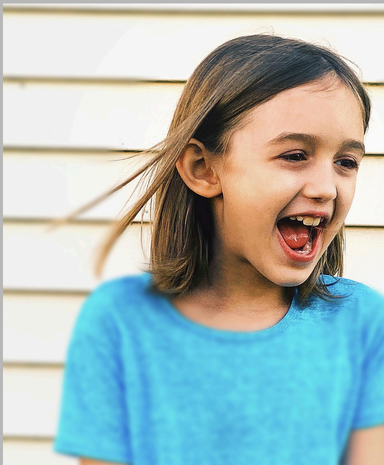
Josie Edlefson Photo 2.mp3