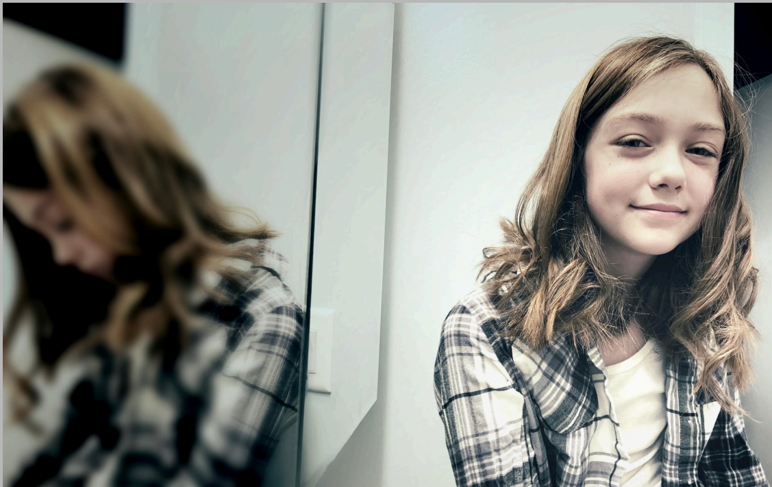
Josie Edlefson Photo 1.mp3