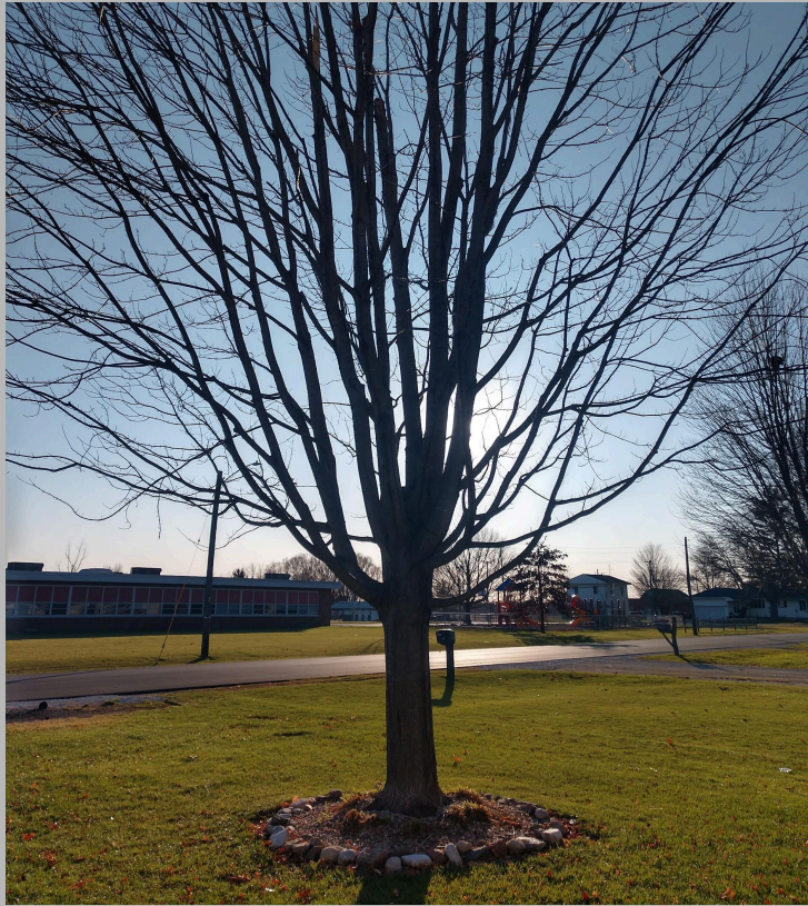
Jordan Britt Photo 1.mp3