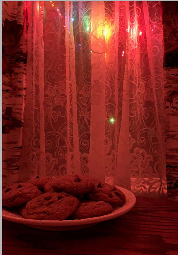
Grace Zeman Photo 1.mp3