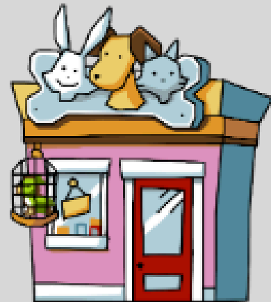
a pet shop