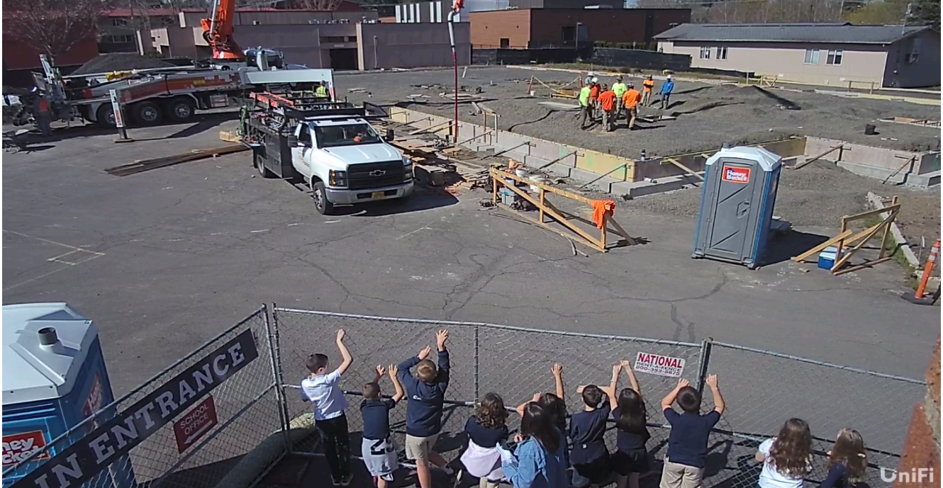
You can view all of the links from this newsletter on our website at school.satigard.org/new-school