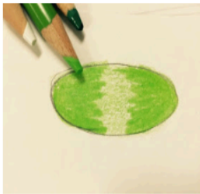
Use heavier pressure with the local color for the mid tone. Leave the middle alone for the highlight.