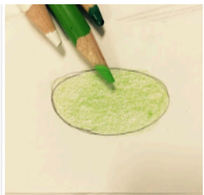
Color lightly with local color