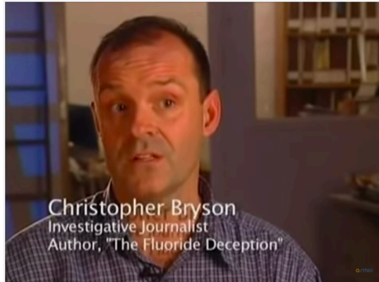
The Fluoride Deception - Full Length Documentary

https://www.youtube.com/watch?v=eBZRb-73tLc