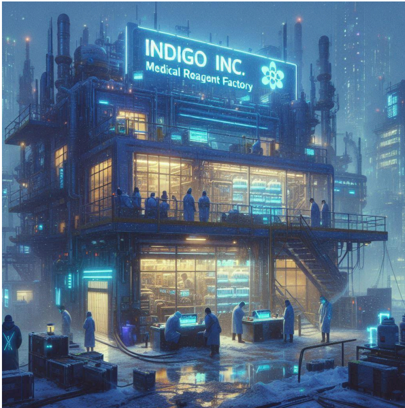
Indigo Inc. Medical Reagent Processing Plant – Planetoid LuY 911, three days before the incident.