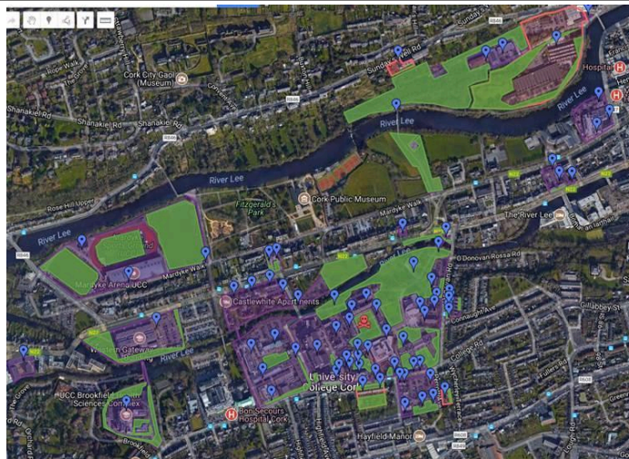
Example of Ratio of Parking Area to Total Campus Area (University College Cork, Ireland)