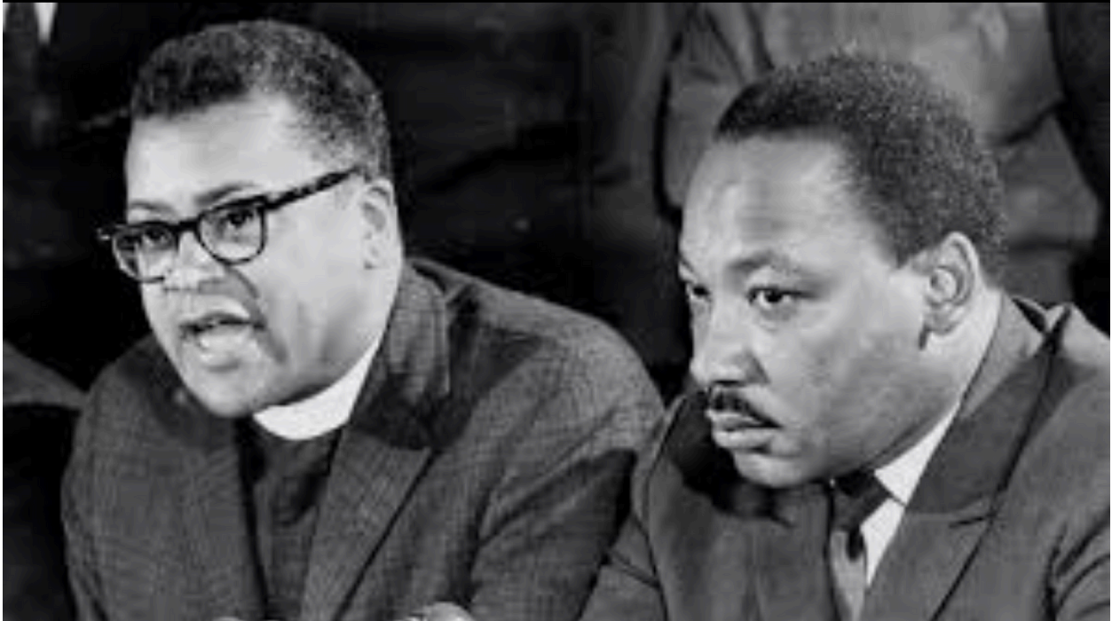
Reverend James Lawson Jr. & Dr. Martin Luther King Jr: 1968, Memphis Sanitation Strike