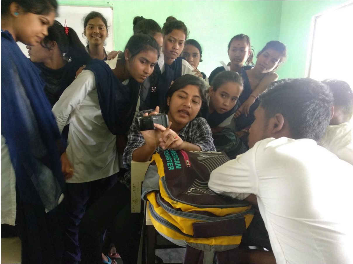
One of the MA C4D students facilitating the camera training process to the school students. Photograph dated 24.01.20