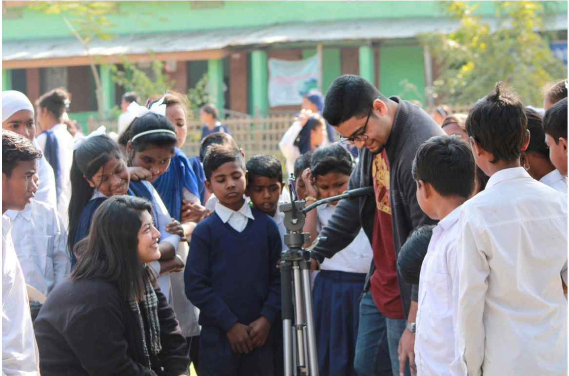
MA C4D students facilitating the camera training process to the school students.

The main goal of the workshop was to create three short films on three different issues in the community/school. Of which, topics were decided by the students themselves, we worked as a facilitator throughout the process of making the movies.