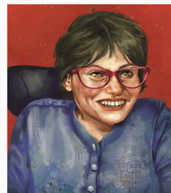
JUDY HEUMANN A disability rights activist and member of the group of "Brave" in 2019. She was named the "Brave" of the year by the government. She has been a leader in the disability rights movement for over 30 years. She has been a leader in the disability rights movement for over 30 years. She has been a leader in the disability rights movement for over 30 years.