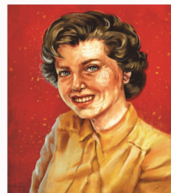
EUNICE KENNEDY SHRIVER A disability rights activist and member of the group of "Brave" in 2019. She was named the "Brave" of the year by the government. She has been a leader in the disability rights movement for over 30 years. She has been a leader in the disability rights movement for over 30 years. She has been a leader in the disability rights movement for over 30 years.