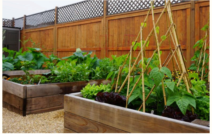
Several of the planter boxes that will be staged in the outdoor queue.