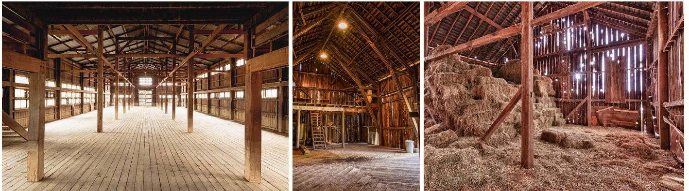
The barn house interiors; Haystacks that will be found in the indoor queue

Upon entering the white barn house, guests will wind their way around more Caterpillar farming equipment that is staged among recently-harvested produce in wooden crates and woven baskets, and several haystacks waiting to be baled. Hanging on the walls of the barn are several hand-held farming equipment (shovels, rakes, hoes, etc.). A chalkboard listing the daily farm assignments can be seen behind a wooden table with a lantern on it. Above the guests' heads are several rows of rustic-looking barn lights that cast a warm glow on the barn's interiors. The hayloft on the barn's (inaccessible) second level is filled with neatly-stacked hay bales. From time to time, a farmhand on a break can be heard whistling a tune from different parts of the hayloft while some barn kittens play around noisily. An Audio-Animatronic barn cat with a light brown and white coat can be found on the same level observing the guests while occasionally licking her paw.