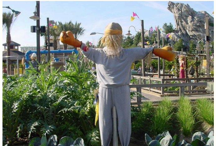
The planter boxes filled with year-round Californian crops and their scarecrows standing guard nearby that will be staged in the outdoor queue.