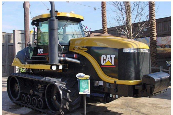
Some of the shiny yellow Caterpillar tractors that will be staged in the outdoor queue.