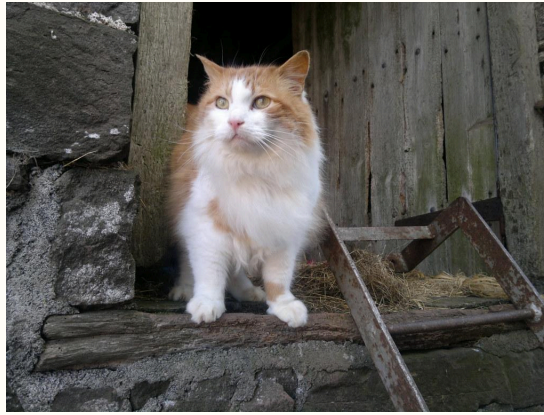
An observant barn cat with a light brown and white coat that will be placed on the second-level hayloft.

After winding their way around the queue, guests will arrive on the other end of the barn where the load/unload station will be. Opposite the loading platforms on where guests would unload is a faded postcard mural featuring the picturesque landscape that Bountiful Valley Farm is sitting on. Rows of growing crops set against the backdrop of the green rolling hills of the Central Valley on a beautiful day can be seen on the mural, with the phrase “ Bountiful Valley Farm: An Abundant Bundle of Joy! ” written across it. Several black barn lamps can be also seen hanging on the wall.