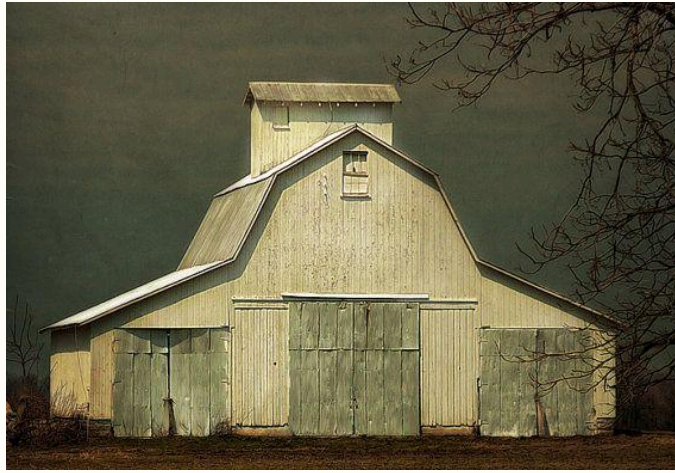
The exterior of the barn house where the queue continues indoors.

Upon entering the white barn house, guests will wind their way around more Caterpillar farming equipment that is staged among recently-harvested produce in wooden crates and woven baskets, and several haystacks waiting to be baled. Hanging on the walls of the barn are several hand-held farming equipment (shovels, rakes, hoes, etc.). A chalkboard listing the daily farm assignments can be seen behind a wooden table with a lantern on it. Above the guests' heads are several rows of rustic-looking barn lights that cast a warm glow on the barn's interiors. The hayloft on the barn's (inaccessible) second level is filled with neatly-stacked hay bales. From time to time, a farmhand on a break can be heard whistling a tune from different parts of the hayloft while some barn kittens play around noisily. An Audio-Animatronic barn cat with a light brown and white coat can be found on the same level observing the guests while occasionally licking her paw.