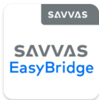
Savvas EasyBridge ⓘ