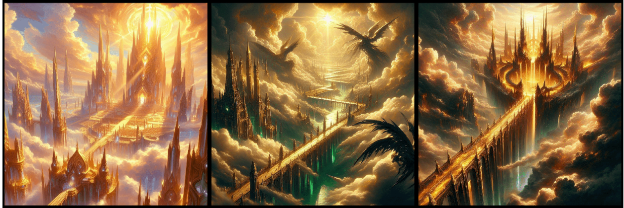
Y.1 Raid Storyline - The Purging of Lordaeron