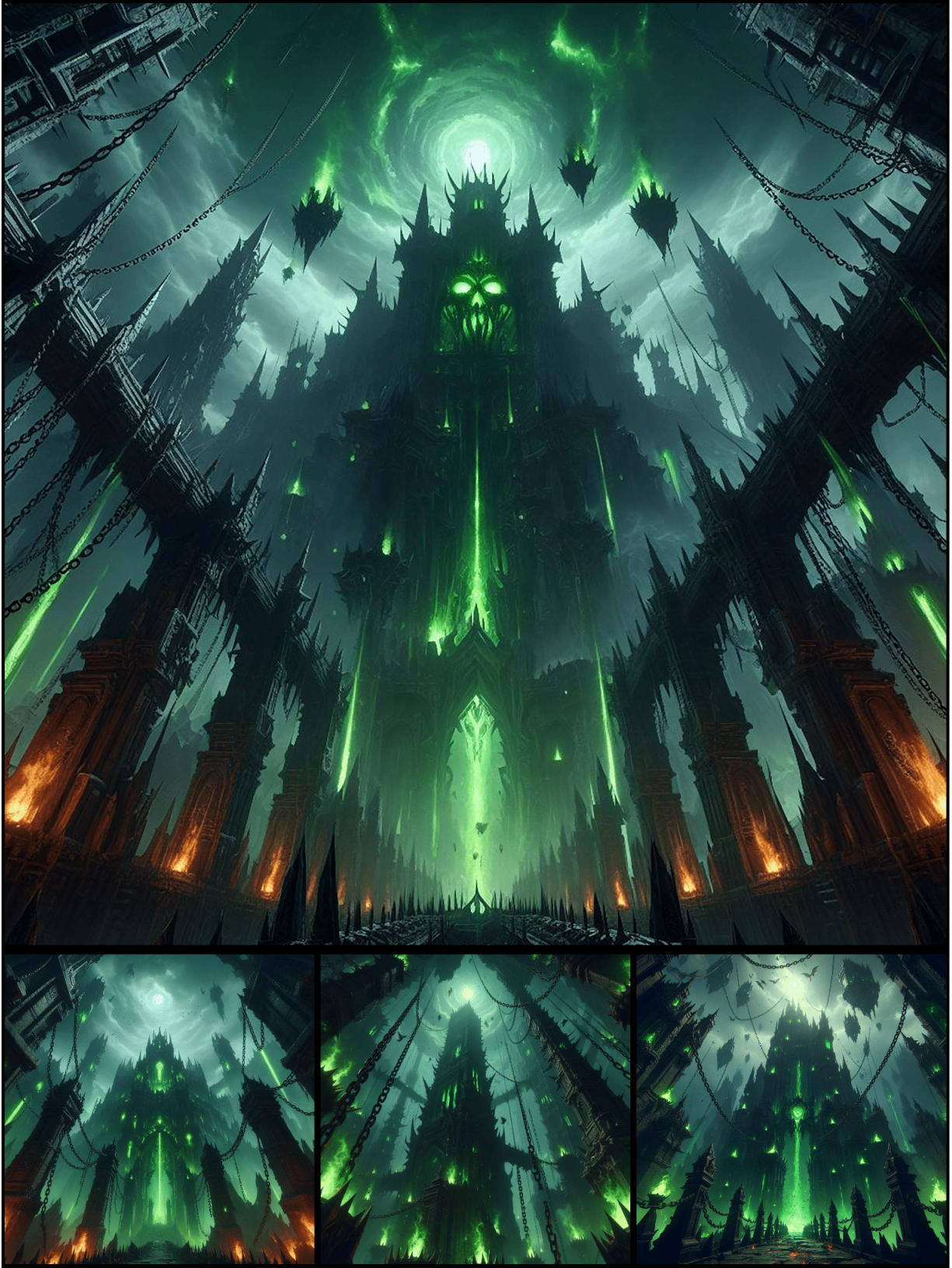
Y.2 Raid Storyline: Gates of Damnation