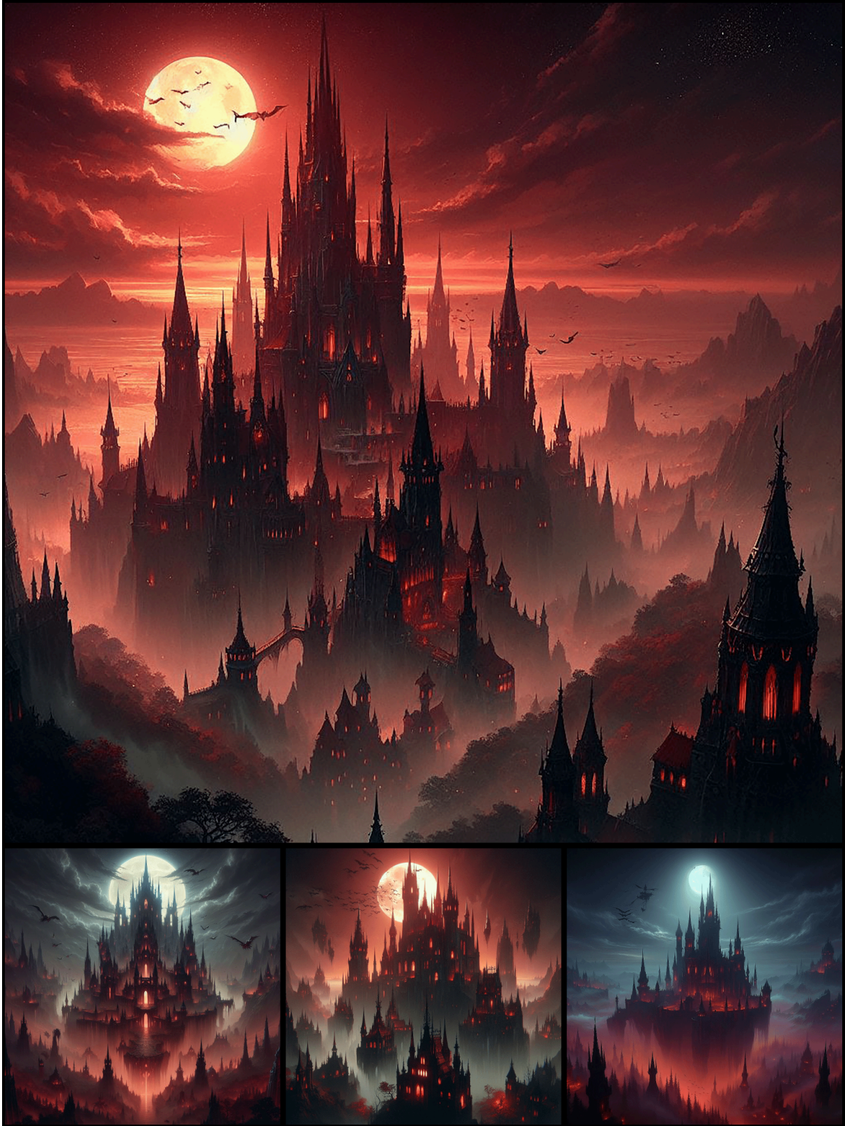
Y.0 Raid Storyline - The Citadel of Dread