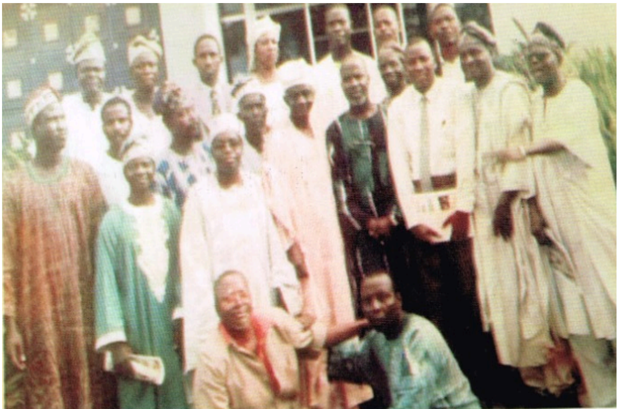
CSIO with some old students

But you left when we had only just begun celebrating your person. Your spirit was still in its prime. You were a mobile library and archive; a faithful encyclopedia of knowledge, culture and liberal education. How very painful to have lost you when the FIGSOSA hearth still longs to have you around as its Illuminate. But our consolation is that you will always be alive in our hearts and minds. Well then: 'another place, another time, another clime, another realm'. In_requescat__en_pace_ . Be well. It is well. K'a sunre Ajala lji. Dele Layiwola,