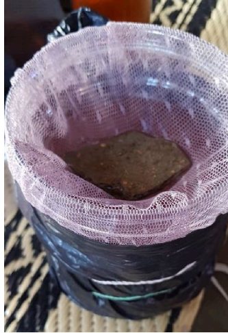
Gambar 1. Ecovitraps dalam rumah