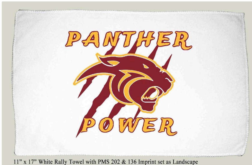
11" x 17" White Rally Towel with PMS 202 & 136 Imprint set as Landscape