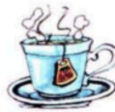
a cup of tea