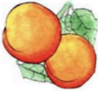
5. .... peaches