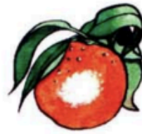
7. .... orange