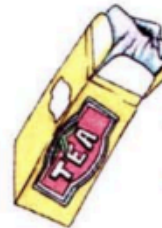
a packet of tea