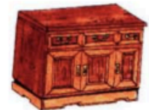
a piece of furniture