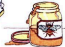
a jar of honey