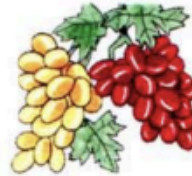
11. .... grapes