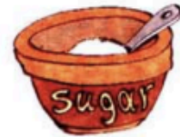
12. .... sugar