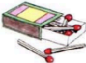
9. .... matches