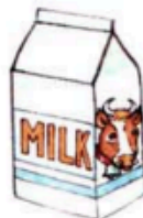
a carton of milk