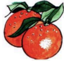
8. .... oranges