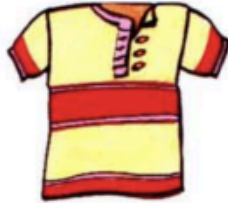
10. .... T-shirt