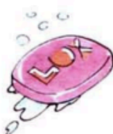
a bar of soap