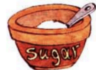
a bowl of sugar