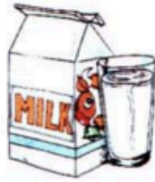
6. .... milk