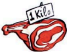
a kilo of meat