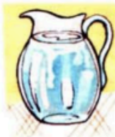
a jug of water