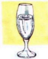
a glass of water