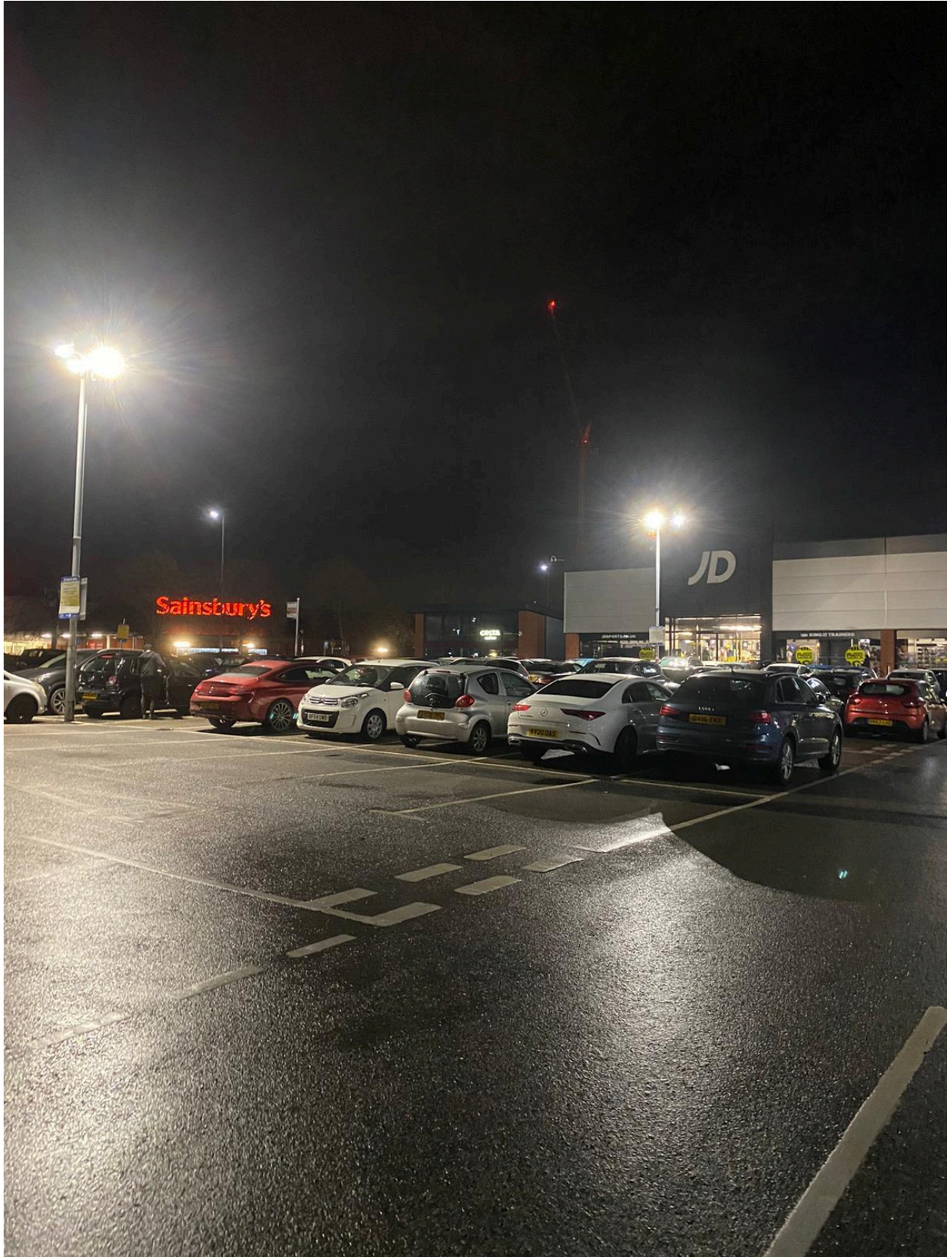
Exhibit 03 – Car park signage (1)