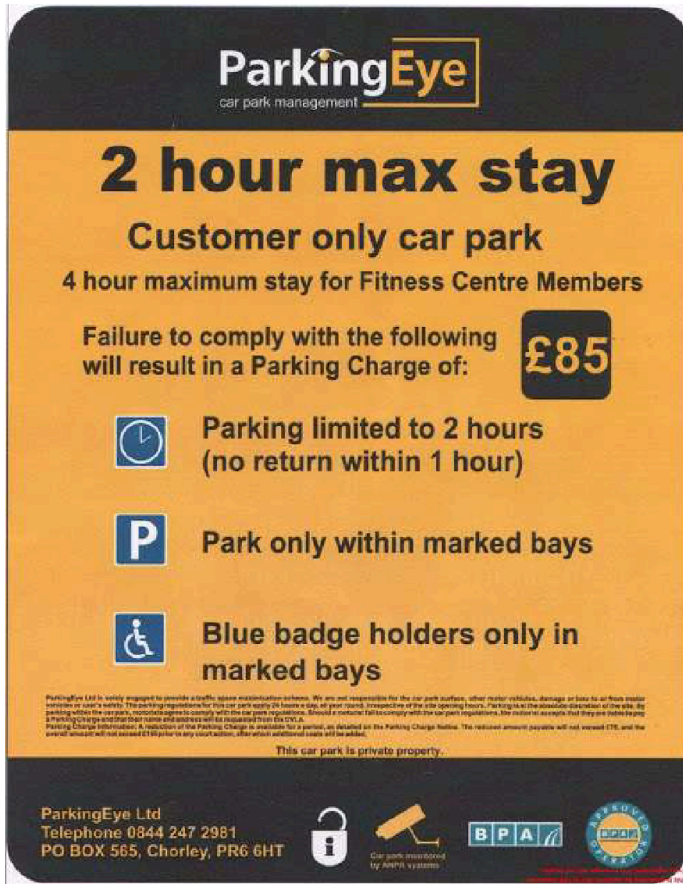
Exhibit 09 – The Beavis case sign for comparison