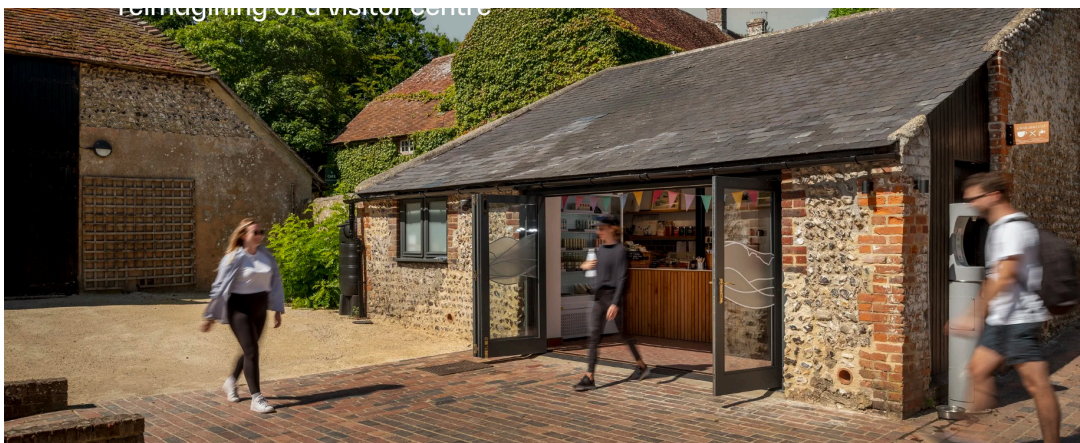
Tuck shop, with pump barn to the left