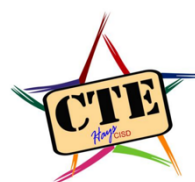
Hays CISD Career and Technical Education Course Guide