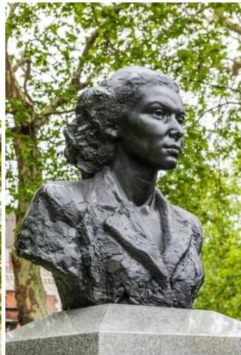
Violette Szabo, up close