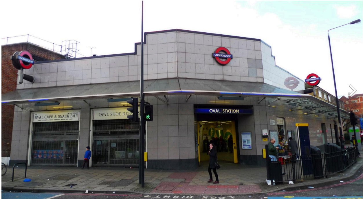
If we turn around as we begin our journey, we see the outside of Oval Station