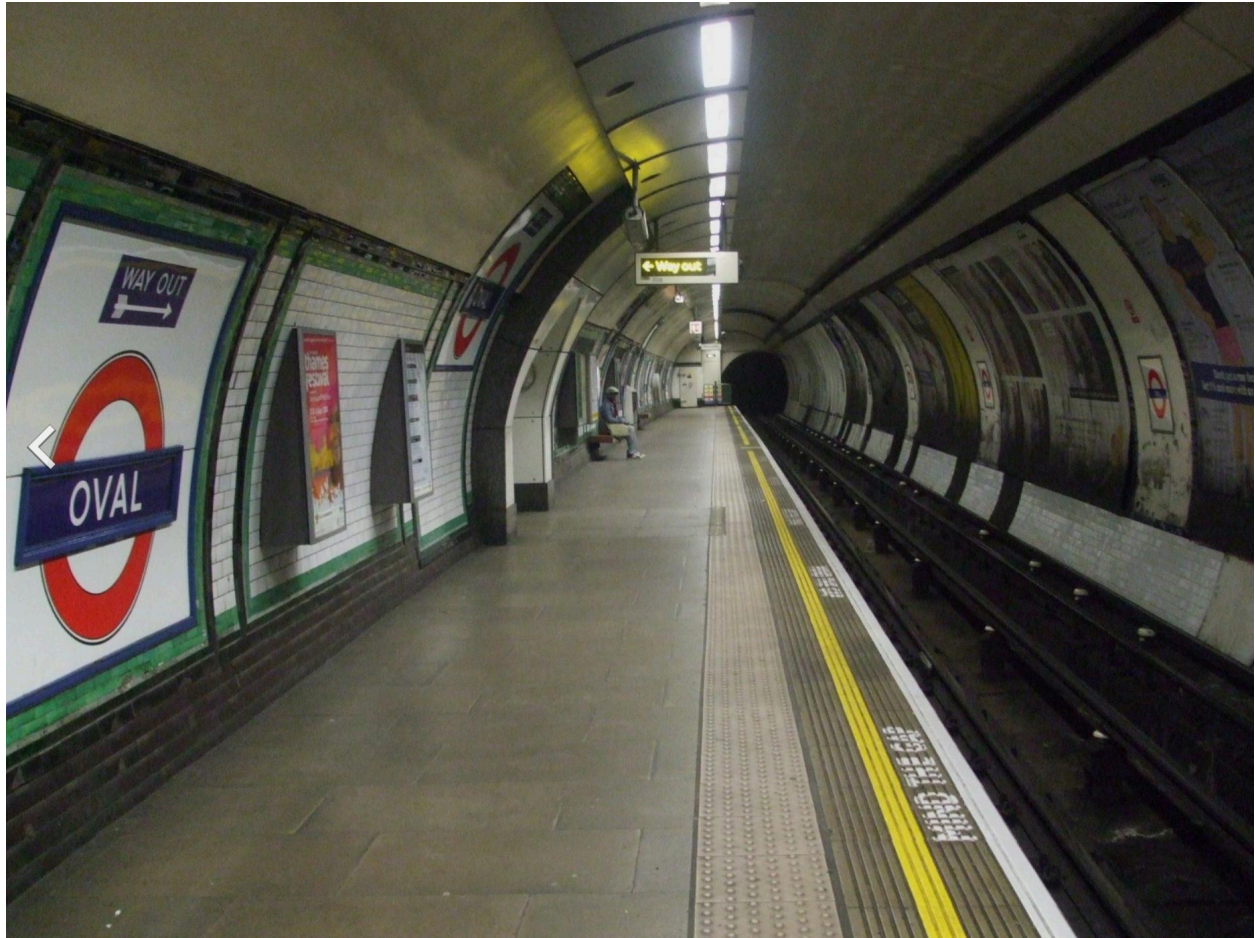
Oval Station southbound platform