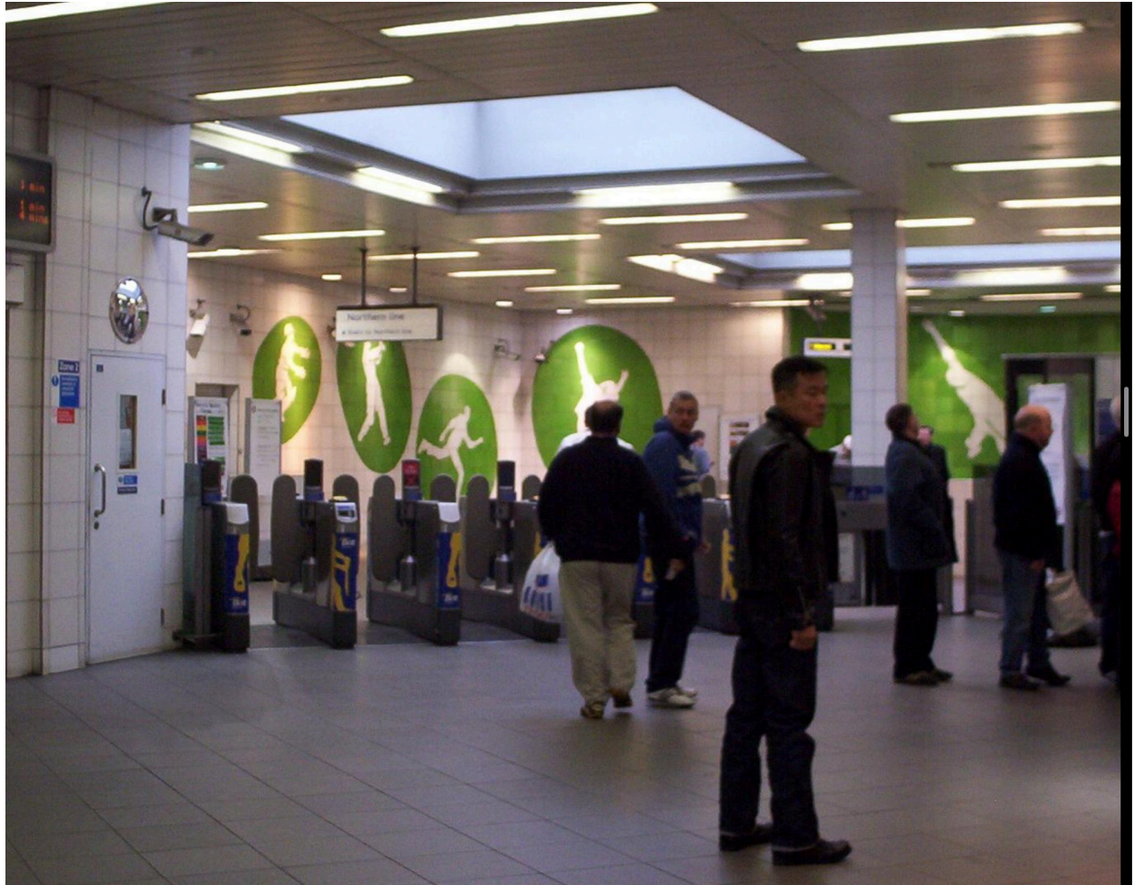
Interior of Oval Station - note the tiles depicting Cricketers in the background