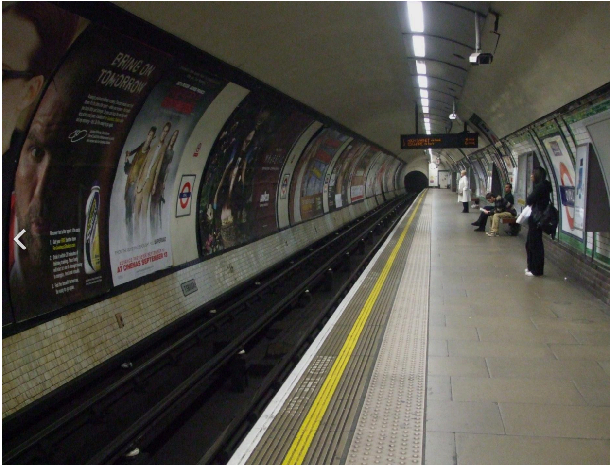
Northbound platform, Oval Station