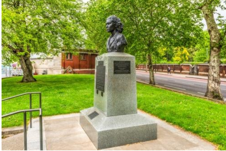
The plaques on the SOE Memorial