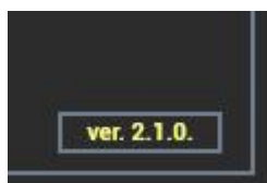
Part of Main popup bottom right corner

The cell shows the current version of the hud installed on your computer