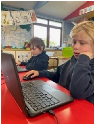
Maths time in P1-3 this morning