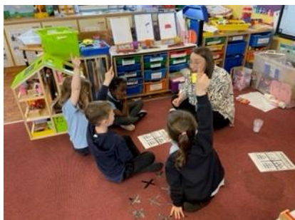
Keen to give the answer!