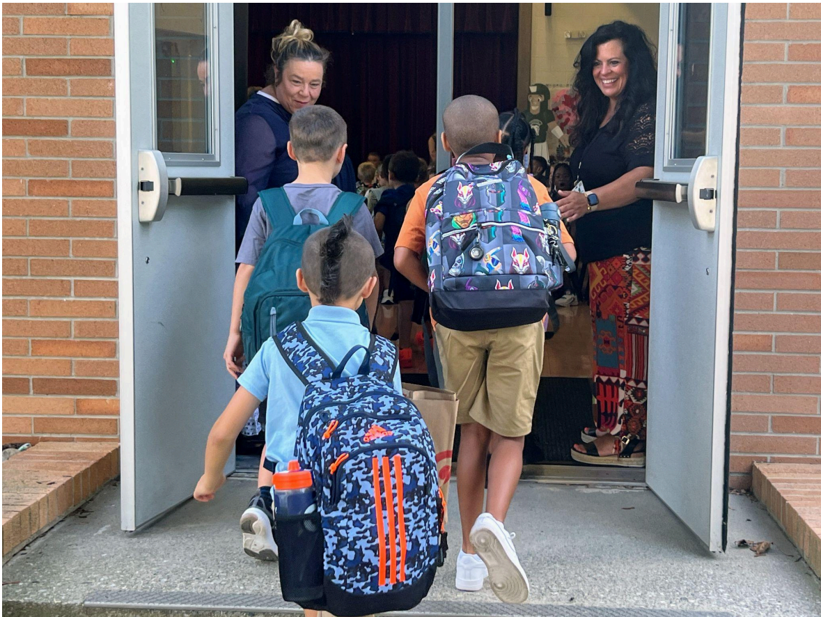
Above: Staff warmly greet students.