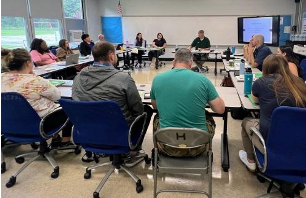
Above: New staff orientation took place in late August. Administrators and new teachers and staff shared thoughts, learned about Spackenkill, and met with mentors.