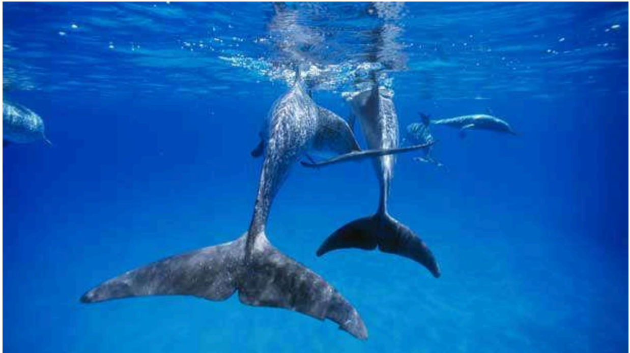
Tail fins of Atlantic spotted dolphins as they swim away at the surface

Those who prefer to cast a line should head out for world-class blue marlin or bonefish hunting. Later, have Bimini Bay arrange for a masseuse to come to your yacht, and enjoy dinner ashore at its restaurant Sabor, where you could try the sesame-crusting yellowfin tuna with local treat guava duff for dessert.