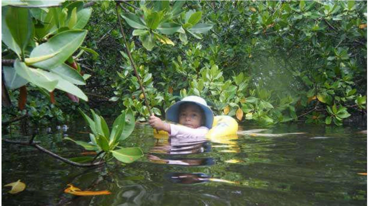
Fountain of youth: Bimini's mystic Healing Hole in the mangroves Strata Smith

It was these islands that also inspired Ernest Hemingway in the 1930s, where he spent much time chasing big game fish and throwing back more than a few rums with the locals.