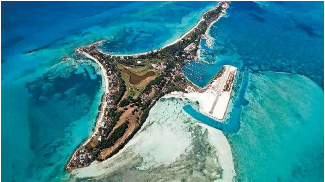
The private island of Cat Cay Cat Cay Club