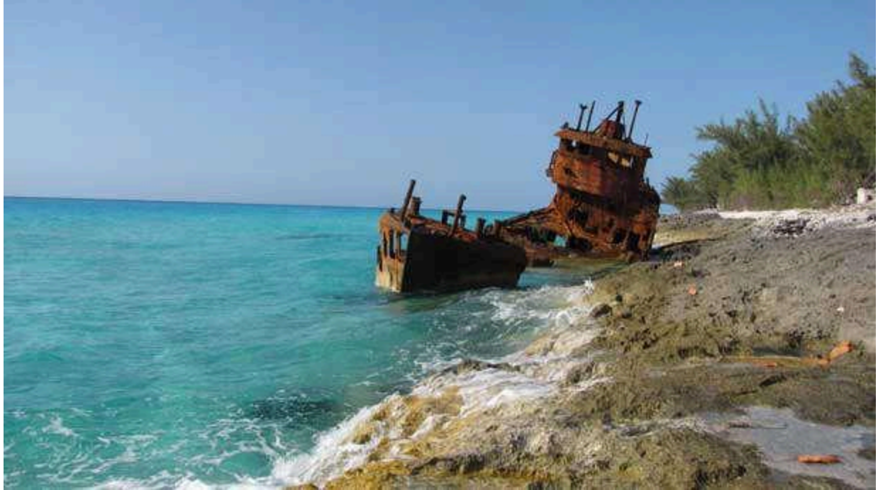
The wreck of the steamer SS Saponais fun for snorkelers