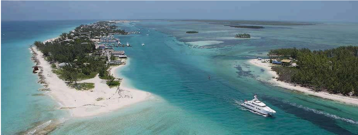
Sudami cruising in Bimini

If you're looking for a romantic getaway, spending a long weekend on a yacht in the Bahamas is just the ticket, with its stunning beaches and crystal clear waters.