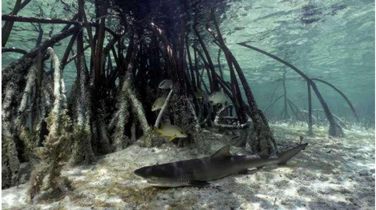
A juvenile lemon shark shelters among mangrove roots in the nursery waters of Bimini