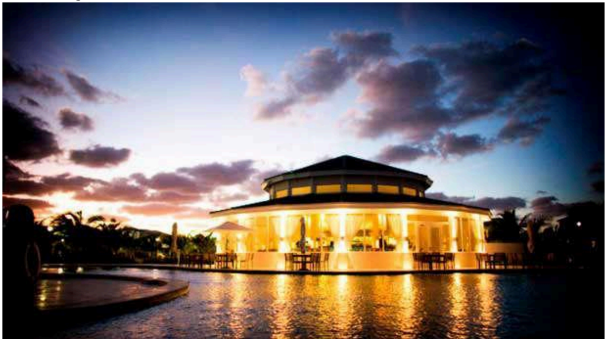
Sabor Restaurant at Bimini Bay Resort