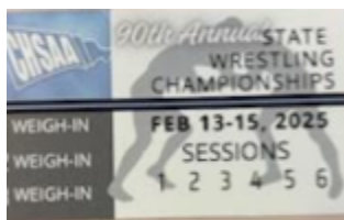
6 additional passes