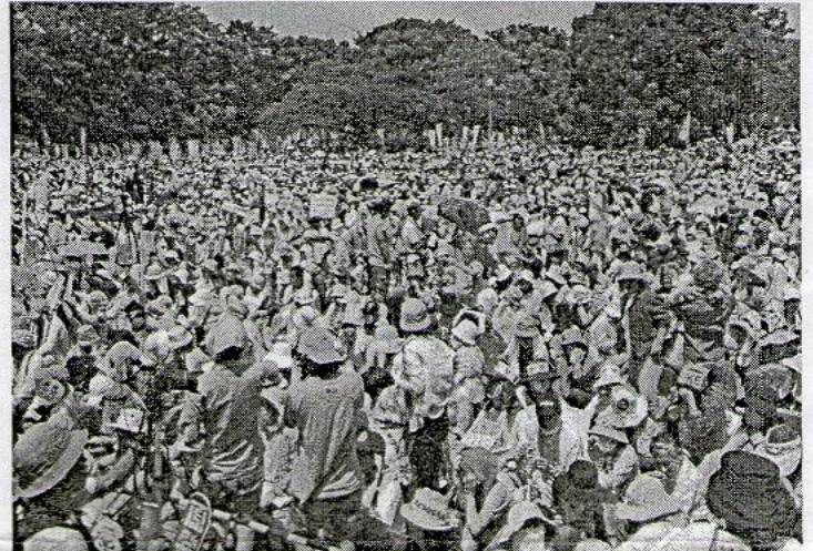
170,000 people from unions and civil society organisations protest nuclear power in Tokyo. For more, click here .