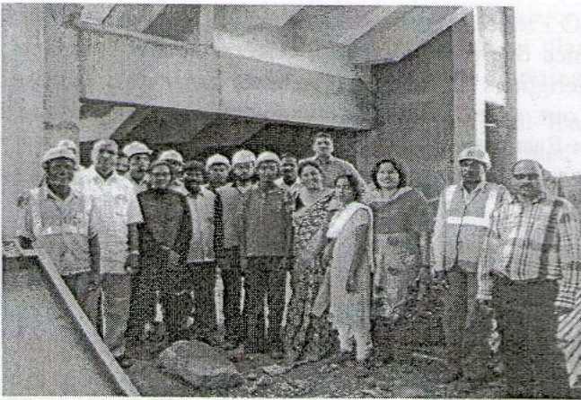
Global union federation representatives, including from PSI affiliates, visited worksites of the Bangalore Metro Rail Corporation on 5 July 2012.