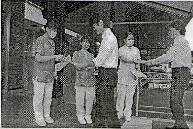
Japan: 3 million have signed a petition demanding action to improve working conditions, reduce turnover, and reduce a serious shortage of nurses. For more, click here .