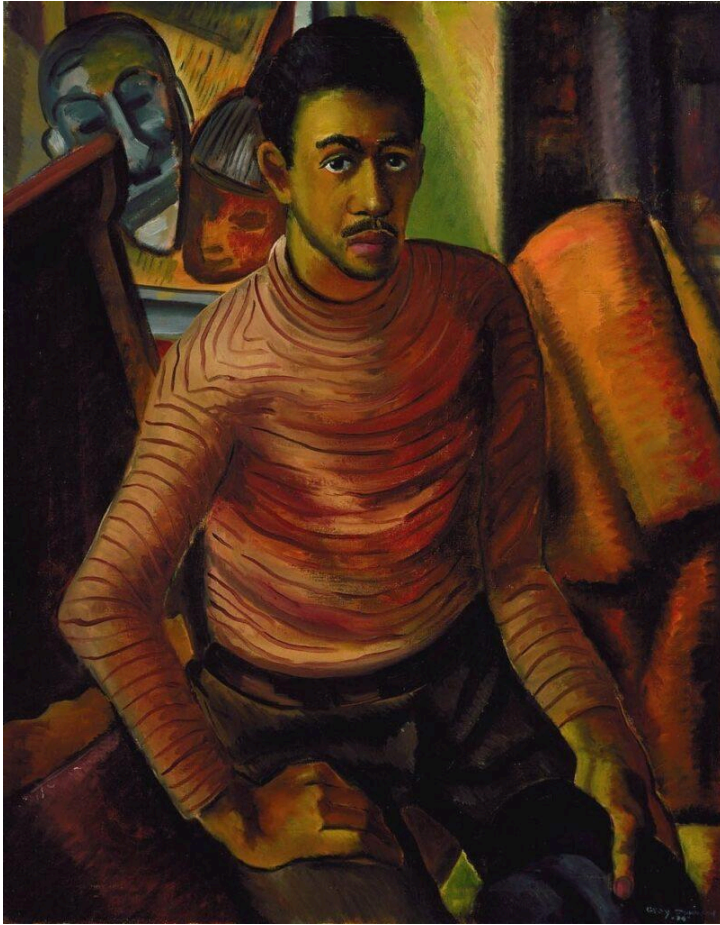
Malvin Gray Johnson, Self Portrait , 1934