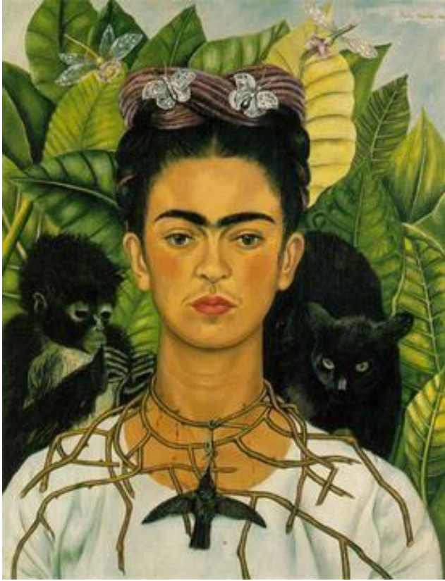
Frida Kahlo, Self-Portrait with Thorn Necklace and Hummingbird , 1940