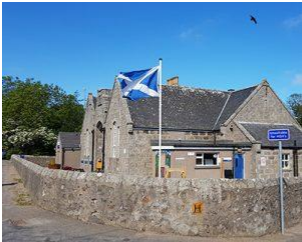
Rathen Primary School

North East Scotland was enjoying one of those bonnie summer days with blue skies, barely a breeze, and birds that canna help but sing, when our Honorary Director arrived at the peaceful village of Rathen – kindly invited there by the staff and children of Rathen Primary School, to attend a grand 'opening'!