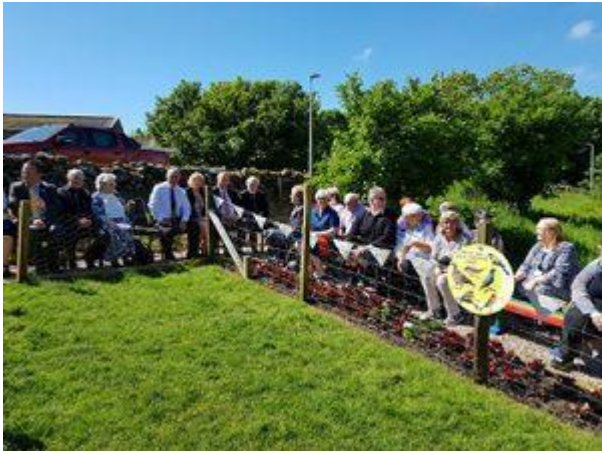
Waiting for the children at the Opening