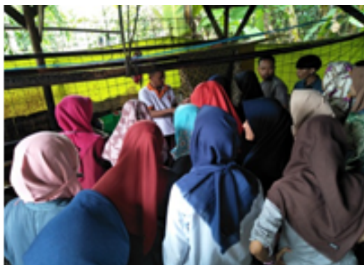
Figure 1. PGSD Student Exploration Activities at the Ciwaringin Batik Center