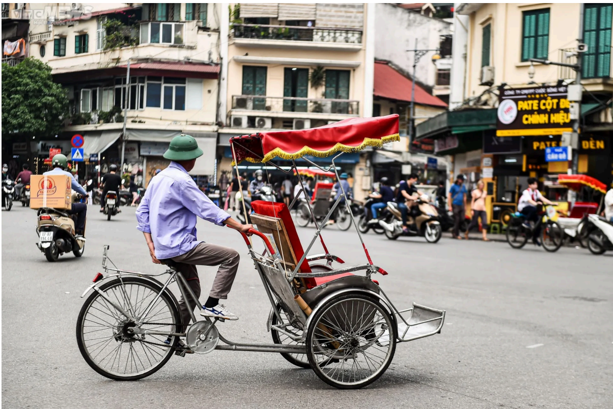
Cyclo is popular among tourists (Sources: Internet)

https://cdn-i.vtcnews.vn/resize/ma/upload/2023/04/25/xich-lo-net-dep-van-hoa-du-lich-ha-noi-11-13581869.jpg