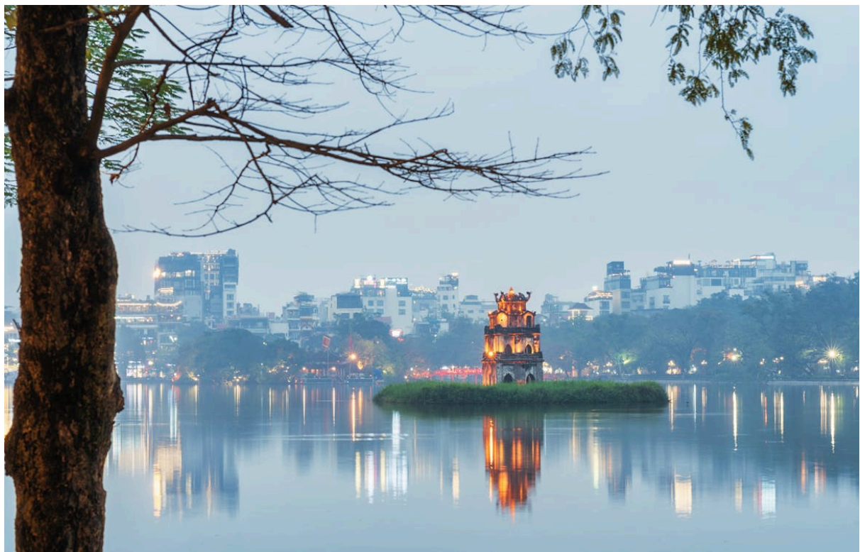
Hoan Kiem Lake is the heart of Hanoi

Nestled in the heart of Hoan Kiem District, Hoan Kiem Lake is conveniently located between the bustling streets of Hang Khay, Le Thai To, and Dinh Tien Hoang. Covering an area of 12 hectares, the lake is easily accessible from any part of Hanoi and is a popular location for both tourists and locals.