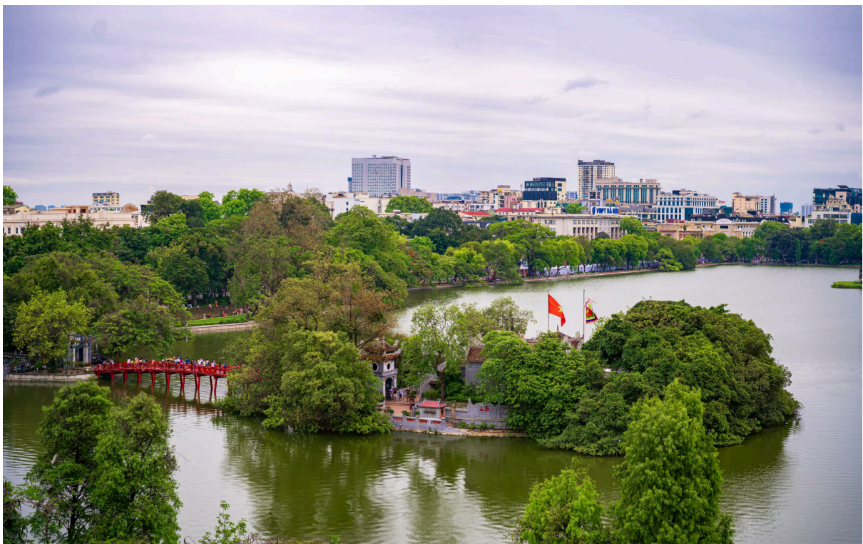
Ho Hoan Kiem - a tranquil space in the center of Hanoi

Visitors to Hoan Kiem Lake can engage in a variety of activities. From taking in the lake's serene beauty to exploring historical sites, there's something for everyone. On weekends, Hoan Kiem Walking Street comes alive with street performances, cultural showcases, and local delicacies, offering a vibrant experience for travelers.