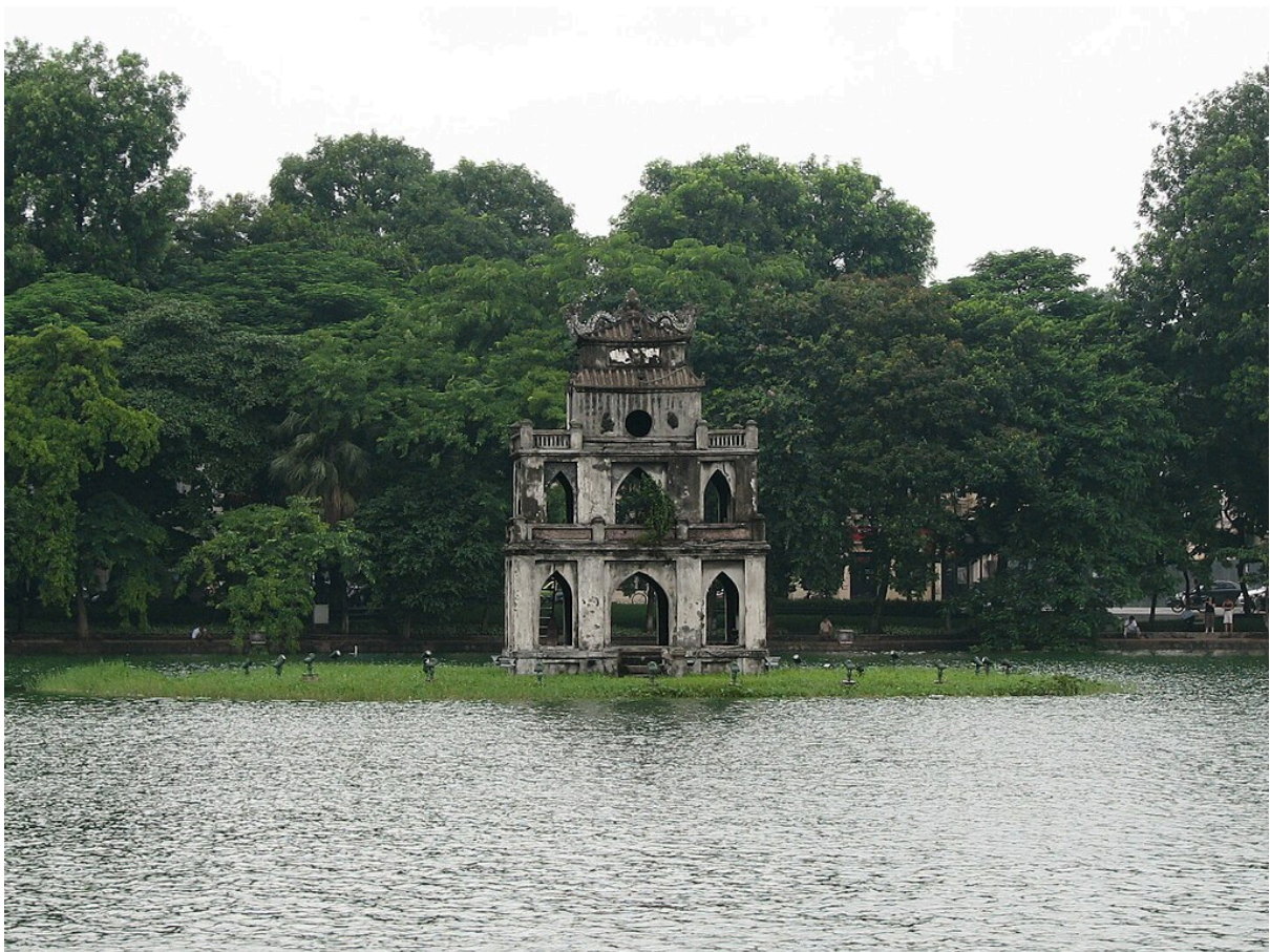
Thap Rua is the icon of Hanoi

Standing on a small island in the middle of Hoan Kiem Lake, Turtle Tower is one of Hanoi's most iconic landmarks. The tower's history dates back to the late 19th century when it was built to commemorate the legendary Golden Turtle, a key figure in the tale of the Lake of the Returned Sword.