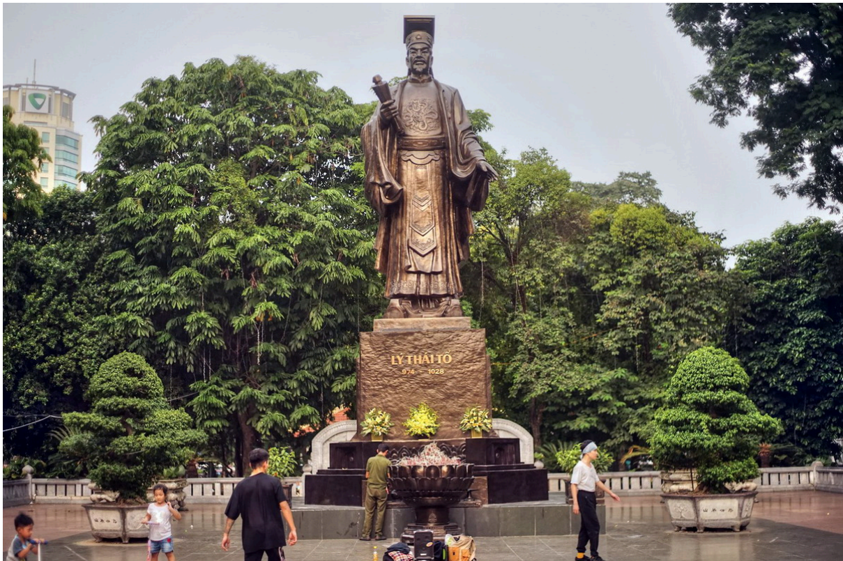
Emperor Ly Thai To chose Hanoi to be the capital of Dai Viet - ancient Vietnam in 1010 (Sources: Internet)

https://redsvn.net/wp-content/uploads/2020/01/Vuon-hoa-Ly-Thai-To-10.jpg