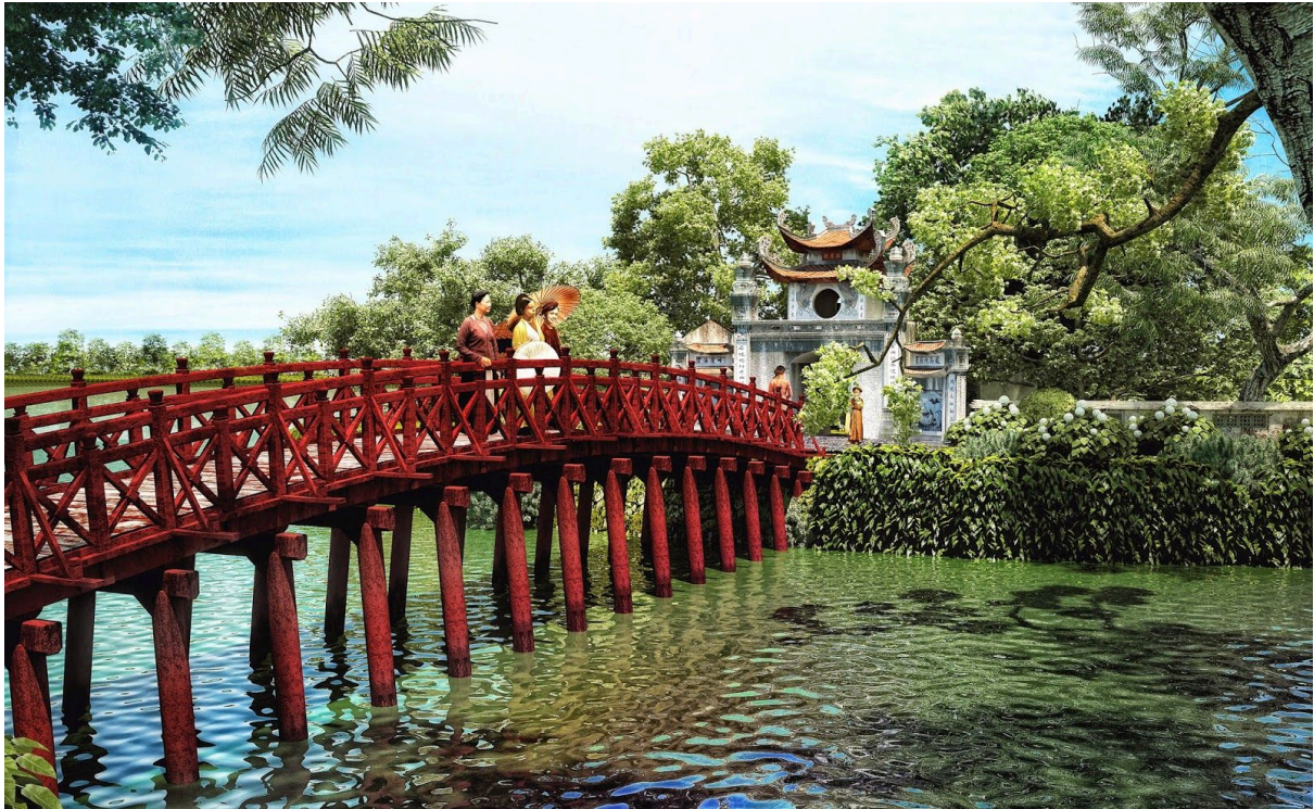
The Huc Bridge connecting Hoan Kiem Lake to Ngoc Son Temple (Sources: Internet)

https://www.vietnamimmigration.com/wp-content/uploads/2012/11/cau-the-huc-ha-noi.jpg