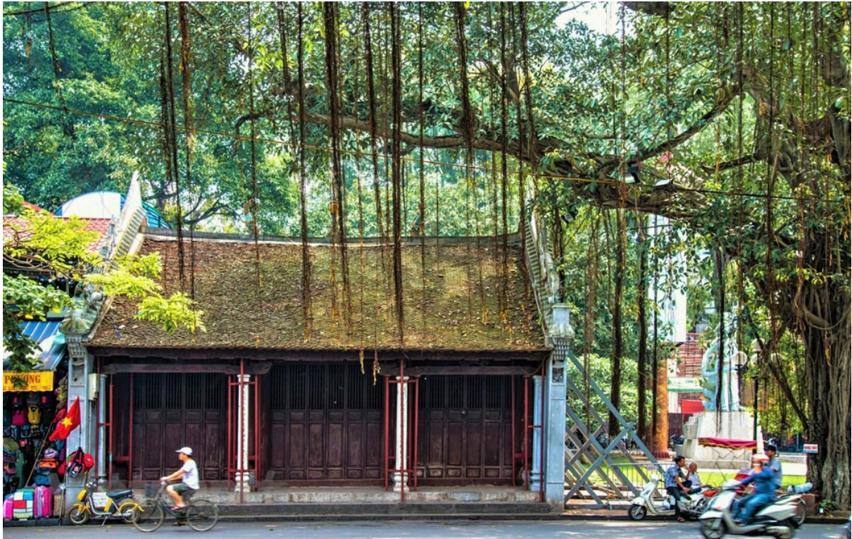
Ba Kieu temple is among the earliest places worshipping Mother Goddesses in Vietnam

https://mediaen.vietnamplus.vn/images/cc571c067c64d4f85fb35f04673bf296d20029be7b8b61451b5054b3fbba6786019c0fbba3e0203854a09c2d98067b28/2.jpg