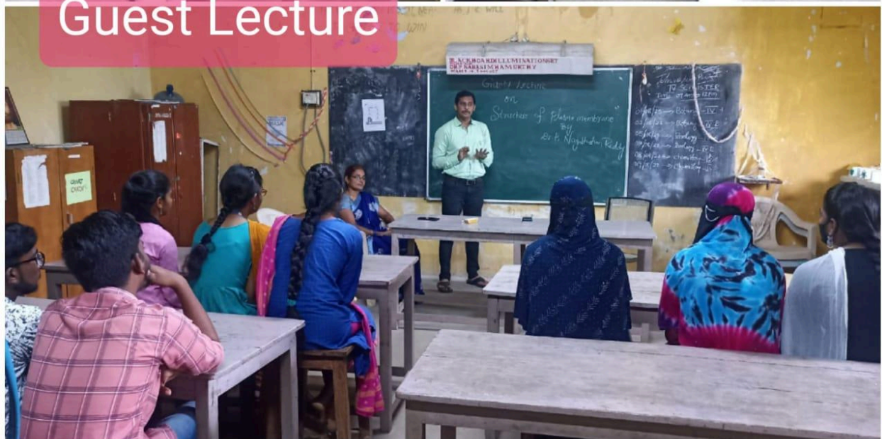
Interaction with Students after delivering Guest Lecture'