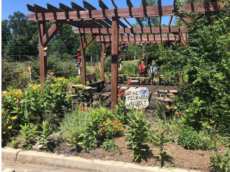
Photo of milkweed learning garden 2024