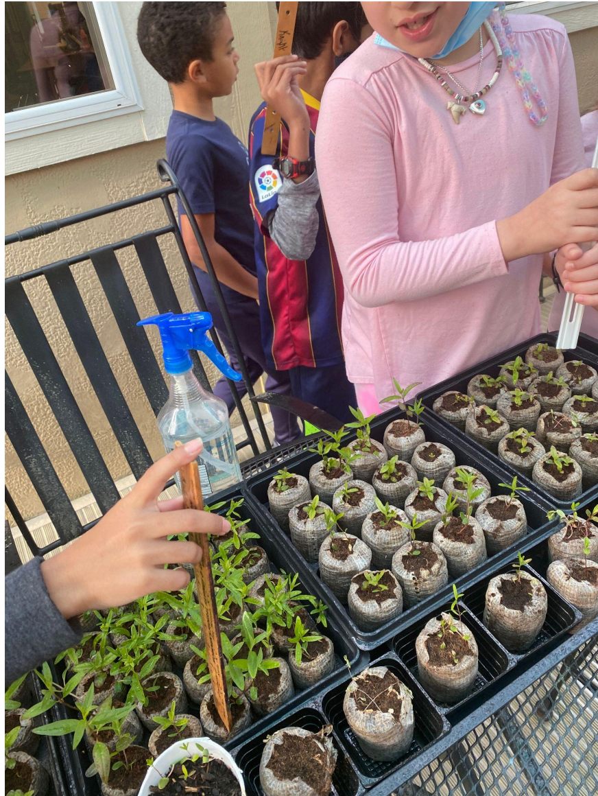
Growing milkweed for the monarch butterflies-measuring the growth and we evaluate our stratification process by trying different methods to see which one works best for future students.