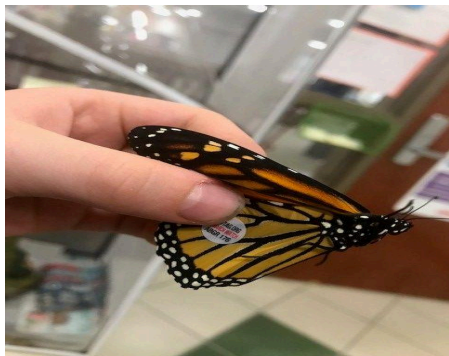
Student holding a monarch butterfly safely to be released outside to make its journey to Mexico.