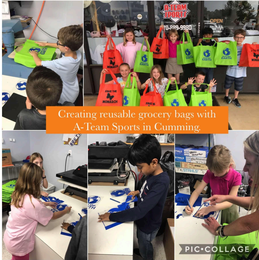
Students working with local business to create reusable bags for our school business 2024