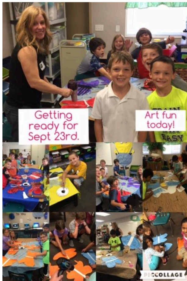
Working with parent volunteers to create visuals for our ribbon cutting ceremony.