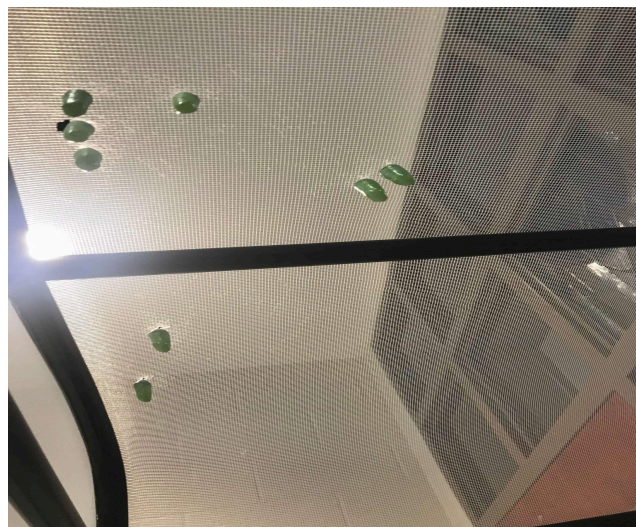
Monarch chrysalises displayed in atrium each year.