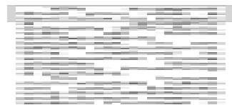
Figure 1. Example of a ONE-COLUMN figure caption.

a. Sample of a Table footnote. (Table footnote)