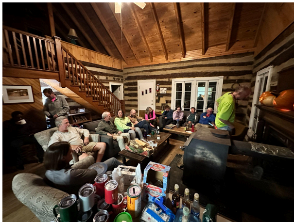
The Crew gathers around the wood stove in the living room on Saturday evening to enjoy each other's company and admire their jack-o'-lanterns