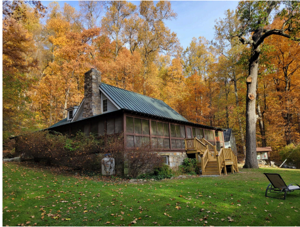
The picturesque Blackburn Trail Center on Sunday morning

While helping cook breakfast on Sunday morning, I was chatting with a crewmember about why she chose the location she did for her college. She said “I’ve always belonged in the mountains.” This got me thinking about the magic of Cadillac Crew. In particular, the annual October Crew weekend at Blackburn Trail Center has a special way of making the mountains feel like home, like you belong there. It made me grateful for the simple things we enjoy together.